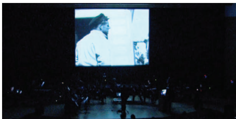
Fig. 2 Performance of Terra Nova at West Road Concert Hall, Cambridge, UK

ate moods, or improvise on, or sometimes these selections were prepared for them especially as cue sheets for specific films (Cooke 2008, Cousins 2011, McDonald 2013). Although this practice all but died out with the advent of sound on film, at various times and to this day, composers and improvising performers have been fascinated by this type of audiovisual performance in which musical instruments give voice to the image. Terra Nova is an attempt to translate this practice to the video game experience, turning it into a performance and adding the uncertainty of the video game narrative.