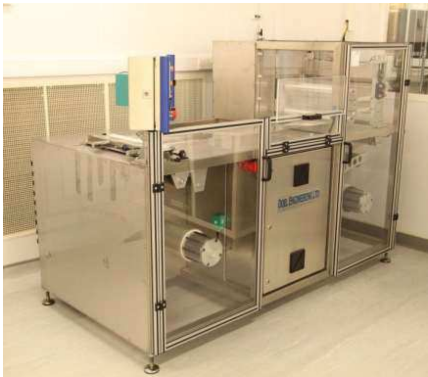
Figure 1: R2R demonstrator / re-winder

CIGS thin-film PV modules have created increased interest due to their unlocked potential for high efficiency and low manufacturing costs. However, much effort is required to overcome some obstacles related to the complexity of this technology and its manufacturing process. CIGS thin film solar production requires highly reliable quality control systems during the different production lines. Manufacturers today face a number of technological challenges; micro- and nano-scale defects can appear at any stage of production, resulting in reduced yield and efficiency, as well as reduced product longevity and performance. To date in process metrology of large area substrates has been extremely difficult. The influence of the manufacturing environment, presence of unwanted mechanical vibration especially when measuring flexible thin layers have made embedding measurement within the context of R2R shop floor systems as shown in Figure 1, a limited factor for the manufacturer. Overcoming this limitation by introducing in-line measurement method can effectively improve manufacturing throughput and make cost reductions.