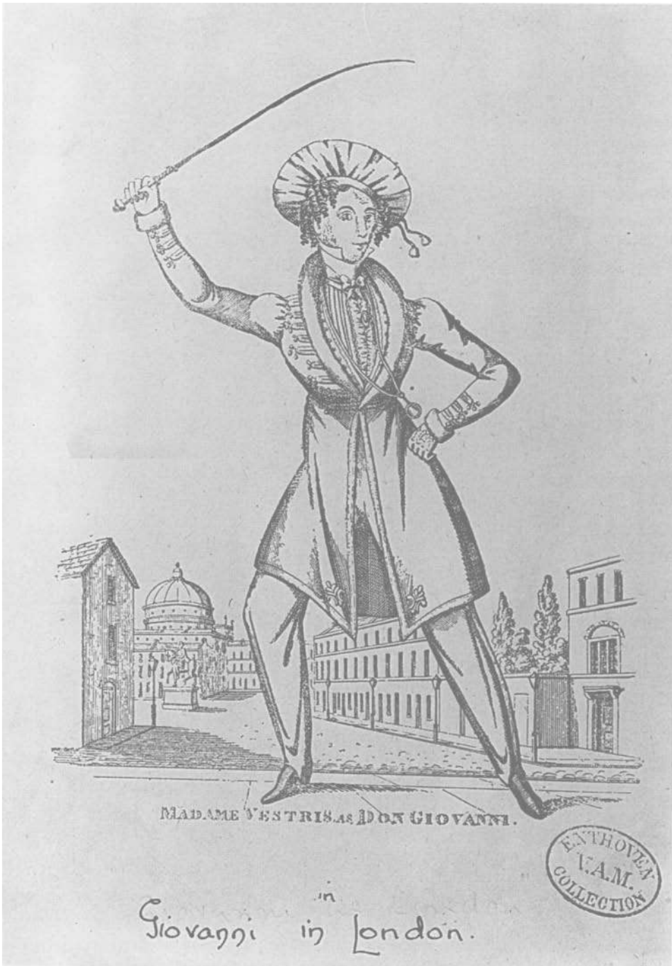
Fig. 2 (b) Vestris as Don Giovanni at Drury Lane, 30 May 1820.