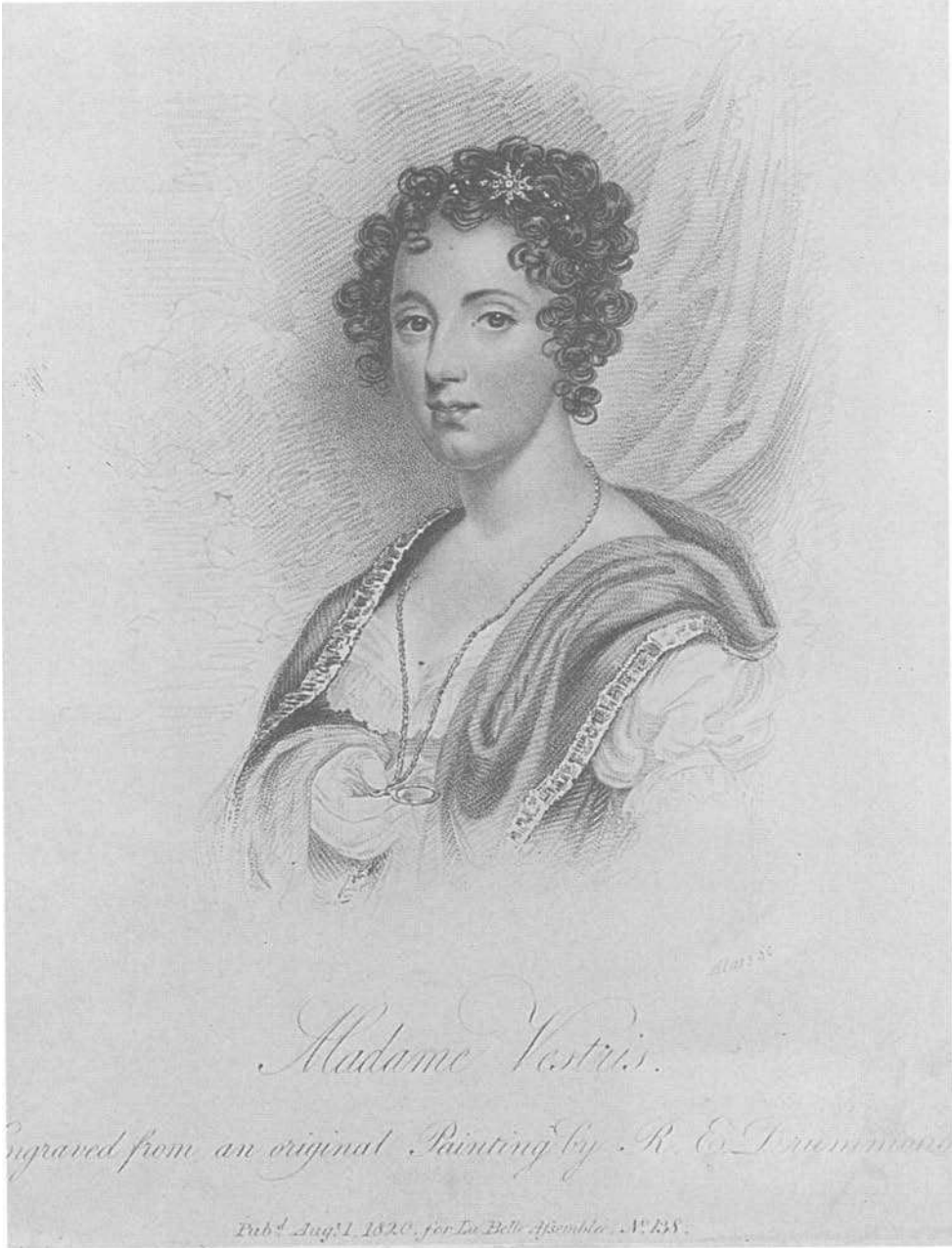
Fig. 2 (a) Portrait of Madame Vestris engraved by Baird of Belfast, c. 1820.