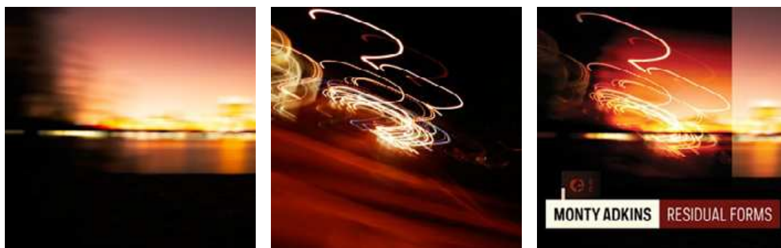
Figure 1. photographic layering (palimpsest) for Residual Forms

This paper explores the theoretical context for audio-visual projects by the authors: Drift Trilogy by Adkins and City Colours by Santamas. The Drift Trilogy ( Rift Patterns , Residual Forms and Radial Drift ) is about the psychogeographical exploration of places and how they impact on our identity and emotions. In the Drift Trilogy the artistic intention is to expand the psychogeographical drift from the city, into the wider landscape as well as to our inner world in which multiple instances of experiencing a place converge to form a palimpsest of that place. This intention is also expressed through the photography accompanying the work by Stephen Harvey, particularly the overlaying of images that occurs in the images for Residual Forms (see Figure 1).