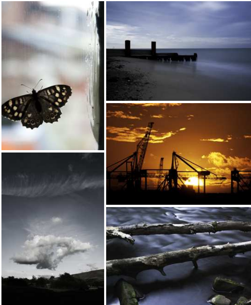
Figure 3. Stephen Harvey's photographs for Rift Patterns (Drift Trilogy Pt.1)

In The Order of Things Foucault (2002) suggests that a similar barrier between language and painting exists - the phenomenology of both is very different. Any attempt to represent one with the other is always going to be problematic as 'Neither can be reduced to the others' terms'. This incompatibility however, could be used to the artist's advantage.