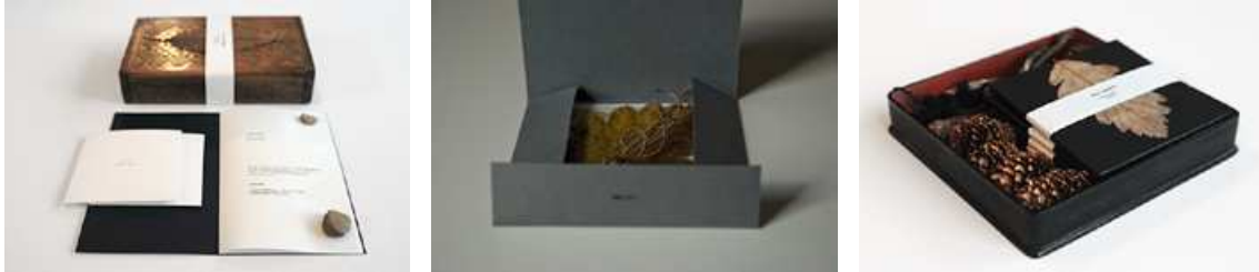
Figure 2. ephemera in Skelton's hand-crafted releases

working on the tracks that signify a 'local' personal sense of place rather than the predominant trend towards globalisation. (see Figure 2).