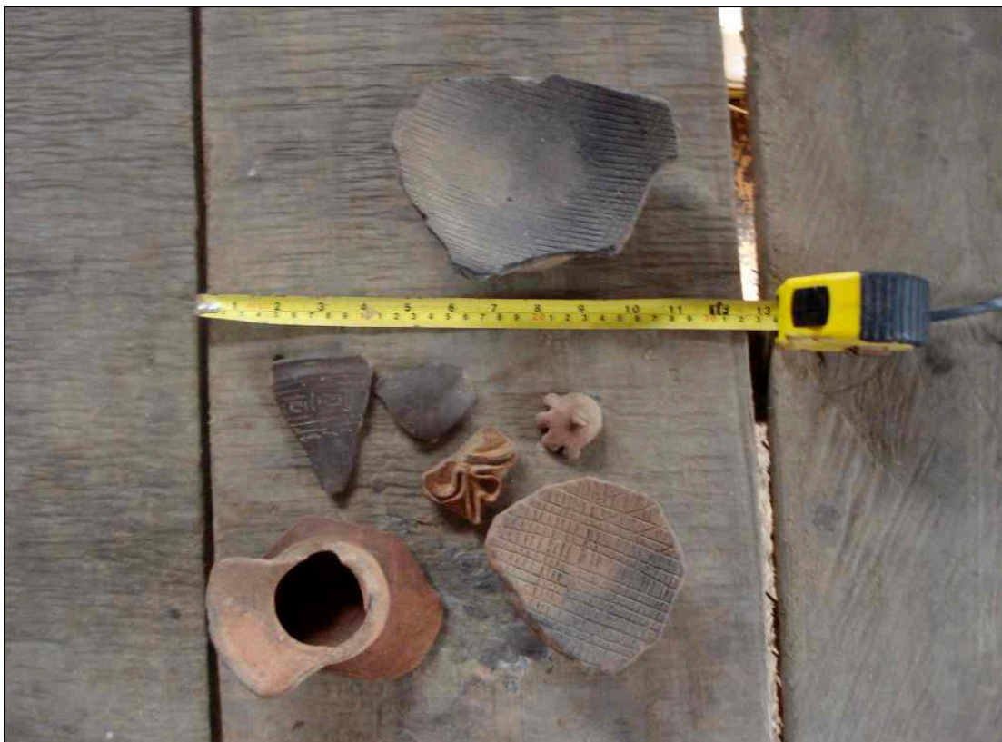
Figure 3. Ceramic fragments found at Rio Ucurganti.