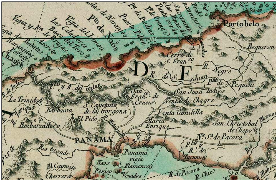
Figure 4. Fragment of Map of Tierra Firme or Castilla de Oro (Panama) in 1785, by Don Juan Lopez, showing the route of the Camino Real from Panama City to Portobelo, and the Chagres river (Source: Bibliothèque nationale de France, département Cartes et plans, GE SH 18 PF 143 DIV 10 P 6).

The Camino Real is the overland trail that connected the terminal cities on both oceans across the isthmus, Panamá on the Pacific and Nombre de Dios on the Atlantic. Its passage was swifter but much more expensive than travelling along the Camino de Cruces – the cheaper, longer, safer, more comfortable and better historically known route – which connected the same destinations but through a mixed terrestrial and fluvial way along the Chagres river. They were both used from the third decade of the 16 th century onwards, when the Camino Real was simply an open path through the jungles until it was partially paved at the end of the century. 82 These trails were crucial in maintaining the commercial, tributary and political links between Spain and its South American empire, and witnessed the passing of over 60% of all the gold and silver taken to Europe in the 16 th and 17 th centuries, 83 especially so over the Camino Real which was designated as the only possible