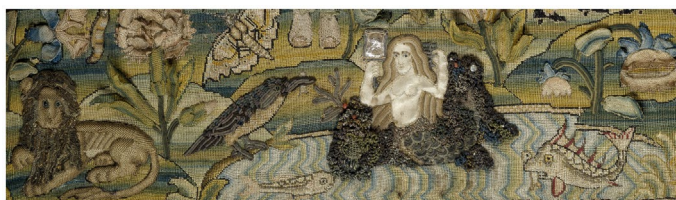
FIG. 3. Embroidered Mermaid (detail), anonymous, British, embroidered picture: 'The Proclamation of Solomon', mid-seventeenth century, 35.4 cm x 47.5 cm, Ashmolean Museum, University of Oxford, WA1947.191.313.