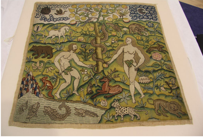
FIG. 4. Anonymous, British, embroidered picture: 'The Temptation of Adam and Eve', mid-seventeenth century, 57 cm x 58.5 cm, Ashmolean Museum, University of Oxford, WA1947.191.308. Published with permission of the Ashmolean Museum, University of Oxford.

contexts. Finally, it considers how technical and material similarities with other embroideries may have encouraged viewers to consider the details of this individual piece in dialogue with a larger body of works.