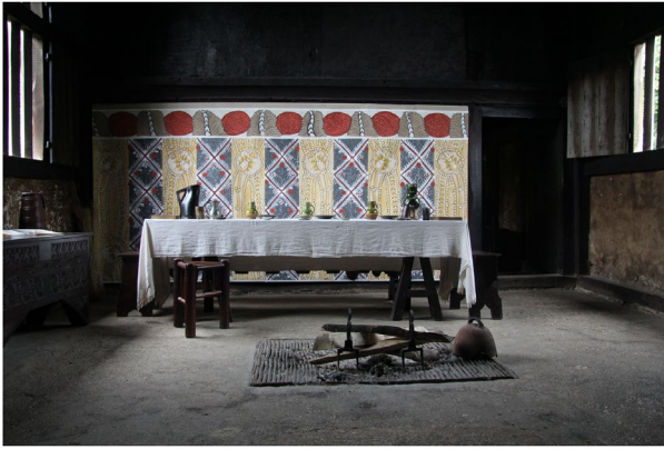
FIG. 5. Replica painted hanging in the hall of Bayleaf Farmhouse (c. 1540), Weald & Downland Open Air Museum, Sussex, as viewed in natural (day)light, July 2014.