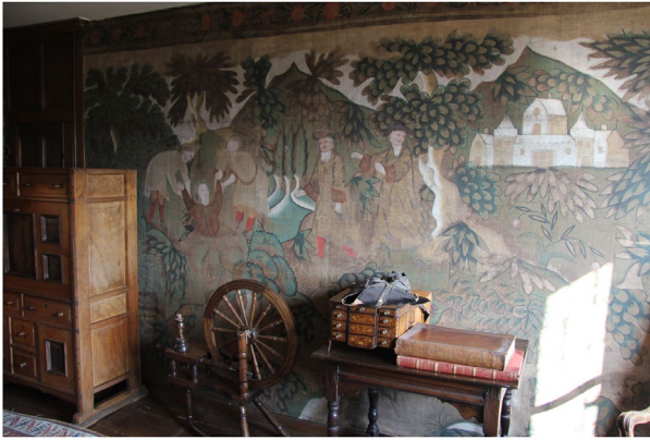
FIG. 8. View of the painted cloths on one of the walls of Queen Margaret's Chamber, Owlpen Manor, Gloucestershire, early eighteenth century.

When asked 'What was the most striking thing about the hangings, and why?', the 'non expert' group mentioned the vibrancy of the colour, especially in relation to the foliage. They also registered their surprise about the hangings, expressing an inability to place a form of textile decoration that was 'quite foreign to the tapestries or wallpaper I'm used to seeing in historic properties', or 'quite unlike any I had seen before'. This suggests the significance of familiarity with aesthetic forms and the alienating qualities of new types of textiles. To a limited extent the 'non-expert' group picked up on the issue which preoccupied the 'expert' group, that is, the impact of the hangings on the atmosphere of the room as a whole. Whereas one participant from the former group said the cloths made the room feel smaller, several individuals in the latter talked about the hangings' complete coverage of the room, one mentioned 'the way they created a complete and intimate feel, a warmth', and another commented on the density of the foliage (Fig. 8).