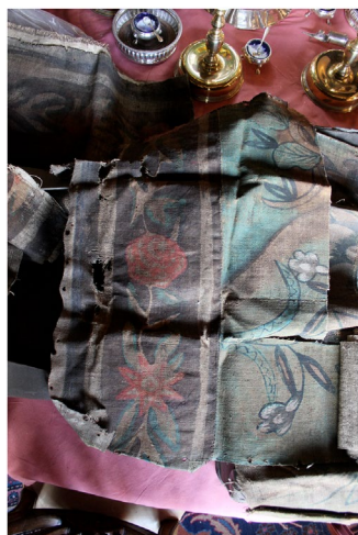
FIG. 1. Offcut pieces of border from the painted cloths at Owlpen Manor, Gloucestershire, early eighteenth century. These were removed when the cloths were moved from their original location and adapted for display in a different chamber.