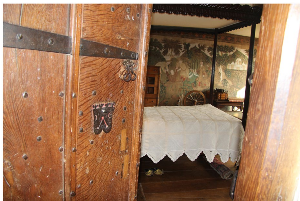
FIG. 7. View at threshold of Queen Margaret's Chamber, Owlpen Manor, Gloucestershire, with the painted cloths visible on far wall, early eighteenth century.

Their responses also showed evidence of a need to structure their visual memories into some kind of order. They either wrote down their recollections of observations sequentially, 'first the bed, then the staged placement of various objects around the room ...', or they organised memories of things noticed hierarchically in relation to the size of the object or the different categories of goods it contained: several responses moved from the bed or the wall hangings to the smaller things on show such as the doll, the hats or the shoes. This strategy for making sense of the different elements of the interior in order to interpret it as a whole suggests a desire to understand furnishings as a group, and to see them as in some way an aesthetic whole — a system of objects — that reflects upon their owner's identity. The movement of the eye across textile surfaces, therefore, might be seen as a summary process which aims to find common ground and a logic to the connections between things.