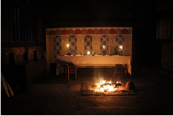
FIG. 6. Replica painted hanging in the hall of Bayleaf Farmhouse (c. 1540), Weald & Downland Open Air Museum, Sussex, as viewed in the evening by fire and candlelight, July 2014.