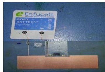
Fig. 1. Battery assisted transfer tattoo RFID tag.

The BAT chip was provided by EM Ltd. [5]. Battery energy is not used by the chip in the return wireless link to the reader, but the transponder receiver sensitivity is increased to different levels according to the chip operational mode. The sensitivities of the four modes are: -17 , -22 , -28 and -31\text{dBm} respectively. This results in significant read range enhancements at the cost of accommodating a battery on the tag and compromising the low profile and active lifespan. To reduce the impact on the tag profile, the battery was a 0.7\text{mm} thick technology marketed by Enfucell [6], and which is shown connected to the tattoo tag in Fig. 1. The tattoo tag dimension is 64\text{mm} \times 20\text{mm} with a slot dimension of 19.5\text{mm} \times 1.5\text{mm} .