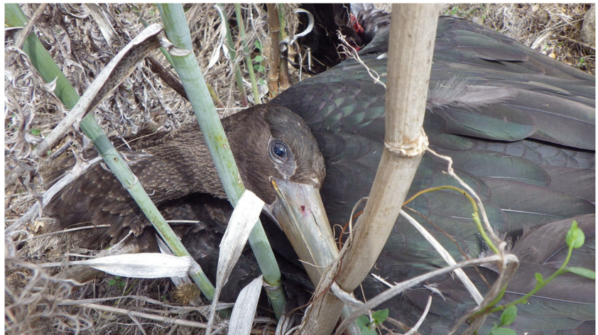
Fig. 1 One of the black storks ( Ciconia nigra ) illegally shot in Malta in 2013.

considerable conservation resources and effort are put elsewhere in Europe continue to be slaughtered in Malta's skies in the 21st Century (BirdLife Malta 2013b).