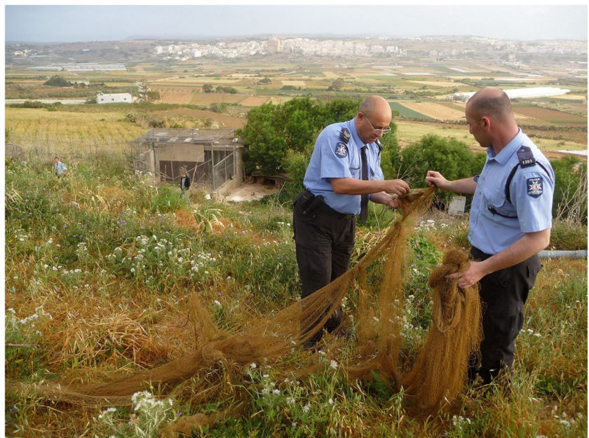
Fig. 3 Administrative Law Enforcement agents dismantling clap-nets from an illegal trapping site.

ALE agents also resent the methods NGOs use to force their constant presence in the field when volunteers spot something illegal or get into trouble - typically through anonymous calls at odd hours reporting illegal shootings,