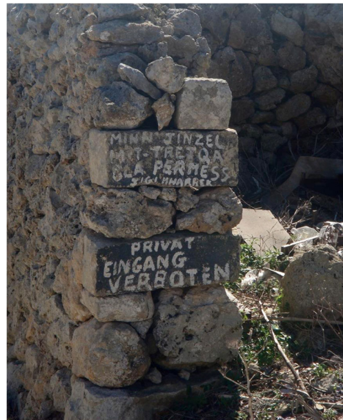
Fig. 2 Sign at the entrance of a field in the Maltese countryside. Caption Reads: [Maltese] Who uses this country lane without permission will be fined; [German] Private. No Entry. Prohibited.

Suddenly, the man reaches for his phone. A brief conversation and he rushes across the field and starts to dismantle the nets. The activists urge their companions to hurry: obviously, someone had spotted them and informed the trapper. Back in the field, the man gives up trying to secure his nets. Nervously,