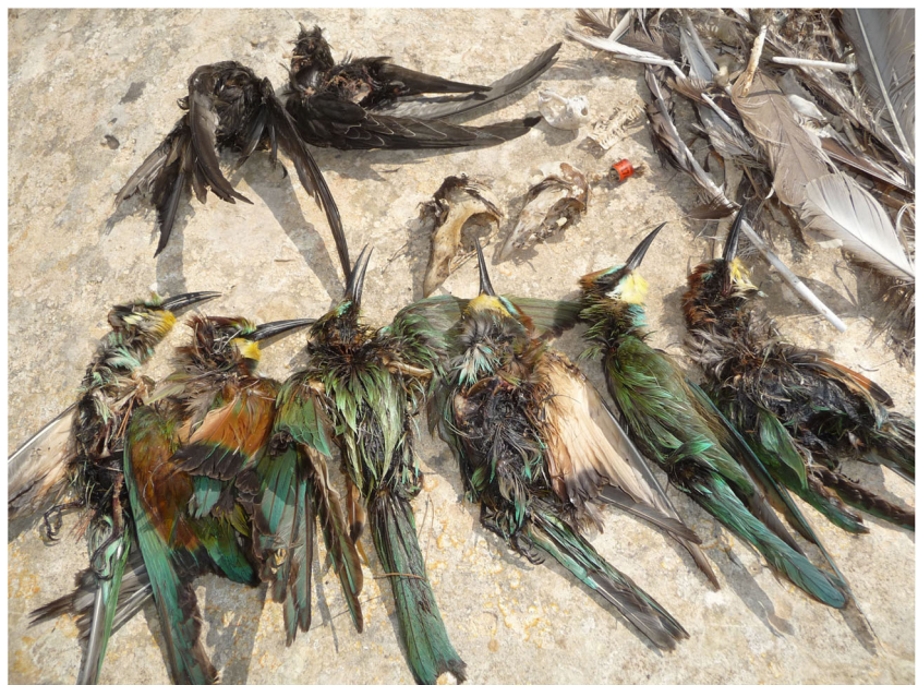
Fig. 4 Carcasses of migratory birds, including Bee-eaters Merops apiaster and Swifts Apus sp. , discovered by the German NGO Committee Against Bird Slaughter on the Dwejra Lines, Malta.

Metaphors are, most social scientists agree, discursive techniques. It must be noted that, in contrast to common parlance, social science does not simply equate 'discourse' with 'speech'. Rather, discourse is seen as incorporating a broader range of sign-systems that carry meaning, including spoken language, bodily gesture, art and music. These expressive techniques in turn reflect the way individuals think about the world and order it into categories (see Bourdieu 1977). Thus metaphors should not be seen solely as fancy linguistic