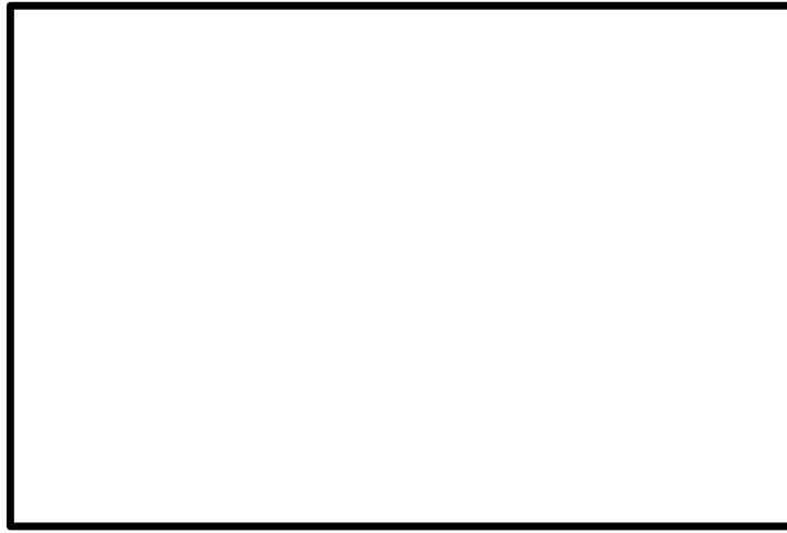
Figure 2: Anna Strasberg during an 'affective memory' exercise.