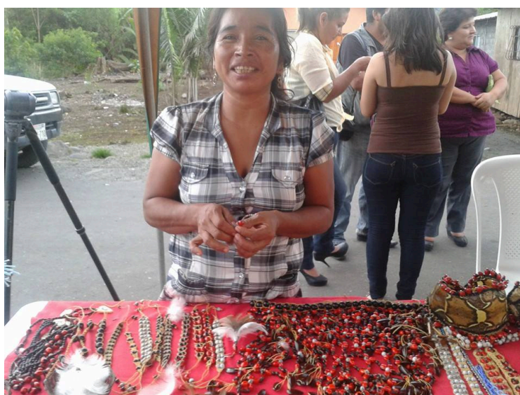
Fig 10: Artesanía made from natural materials.

I thought about it for a moment and had to agree that they would. After all, it was a classic example of the cultural tourism that had become so popular in the Ecuadorian Amazon in recent years (although not nearly as popular as Amazonians assumed it to be – see Carpentier 2012). During my periodic trips to Quito I would usually stay in a hostel frequented by ‘Western’ backpackers, mostly Europeans, Americans and Australians. They would often exchange stories and advice about trips to the rainforest that were highly illuminating. One Spanish backpacker told me that he had stayed with the ‘real Shuar’ in an ‘isolated village’ an hour’s walk from the main road. While there he had eaten ‘traditional food’ which mainly appears to have consisted of insects and their larvae. Another showed me the various items of jewellery he had picked up while visiting a ‘Shuar village’. He had bracelets, necklaces and bags made of seeds. I remembered a conversation I had recently had with a woman who made and sold ‘Shuar’ jewellery: she told me that the artesanía made with seeds was aimed exclusively at a ‘ gringo ’ market, as Shuar themselves preferred brightly-coloured plastic beads.