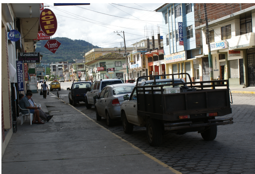
Fig. 4: Sucúa city centre.

Contemporary Sucúa is a rainforest city with a population of 12619 (INEC 2011), the capital of the county ( cantón ) that bears the same name. Approximately one third (34.8%) of the county's population is indigenous; the proportion of the urban population is not recorded but is likely to be slightly less, as much of the rural population consists of Shuar centros . According to INEC, the indigenous population of Sucúa has risen by 24% since 2001 (INEC ibid ).