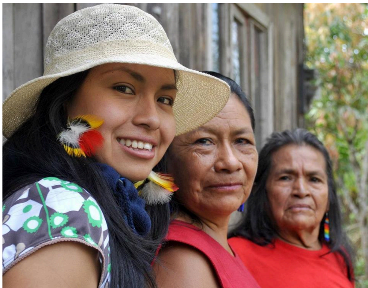
Fig. 13: Three generations of Shuar women.