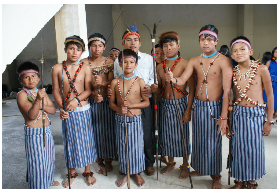
Fig 6: Ready to perform.

The dances were taking place at one end of the auditorium. The other school groups, those who had already performed as well as those that were yet to go on stage, were seated along ascending rows of stone steps that ran around three sides of the building. The remaining space was reserved for dignitaries, most of whom were apparently local politicians. Our students filed nervously onto the dance floor, the beads on their belts and ankles rattling. Hilda, standing next to me, took a deep breath, and then the music started.