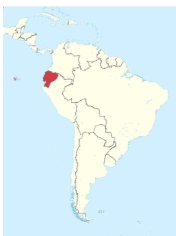
Fig 1: Map of South America showing location of Ecuador.

Ecuador is a nation in the north-west of South America, bordering Colombia to the north, Peru to the south and east, and the Pacific Ocean to the west. Although it boasts an area of 283,561 km 2 (CIA World Factbook 2013), slightly larger than that of the United Kingdom, its population is considerably smaller at around 15,500,000 (INEC 2011). As its name suggests, Ecuador straddles the equator, which is approximately 25 kilometres north of the capital city, Quito.