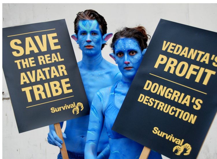
Fig. 5: Save the real Avatar.

Nevertheless, with increased emphasis upon the principle of self-identification as a means of determining whether an individual or group can be considered indigenous (Colchester 2002), indigenous peoples have the opportunity to creatively redefine the concept of indigeneity. As Li observes, the adoption of an indigenous identity is not inevitable; it is a ‘positioning’ that ‘draws upon historically sedimented practices, landscapes, and repertoires of meaning, and emerges through particular patterns of engagement and struggle’ (2000:151). One such example is Li’s own ethnography of the Lindu in Indonesia (ibid); another is Omura’s study of ‘Inuitness’ as defined by the Inuit people themselves, in which new phenomena such as tea drinking and snowmobiles can be combined with existing practices without appearing contradictory (Omura 2002). Greene’s work with the Aguaruna in the Peruvian Amazon demonstrates that indigenous groups are able to ‘customise’ indigeneity so as to suit their own needs and political agendas (2009). This capacity to define what it means to be indigenous is crucial for societies claiming to be so, because while the control rests in the hands of non-indigenous groups (however well-meaning) the latter remain the arbiters of authenticity. A change in academic or activist fashions might be all that was needed to lay waste to an estimated 300 million people’s hopes for self-determination (Niezen 2000).