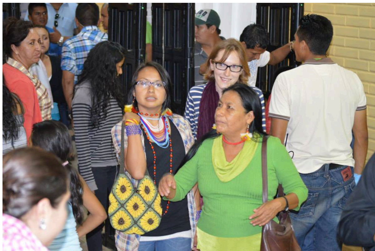
Fig. 12: Attending the President's speech.