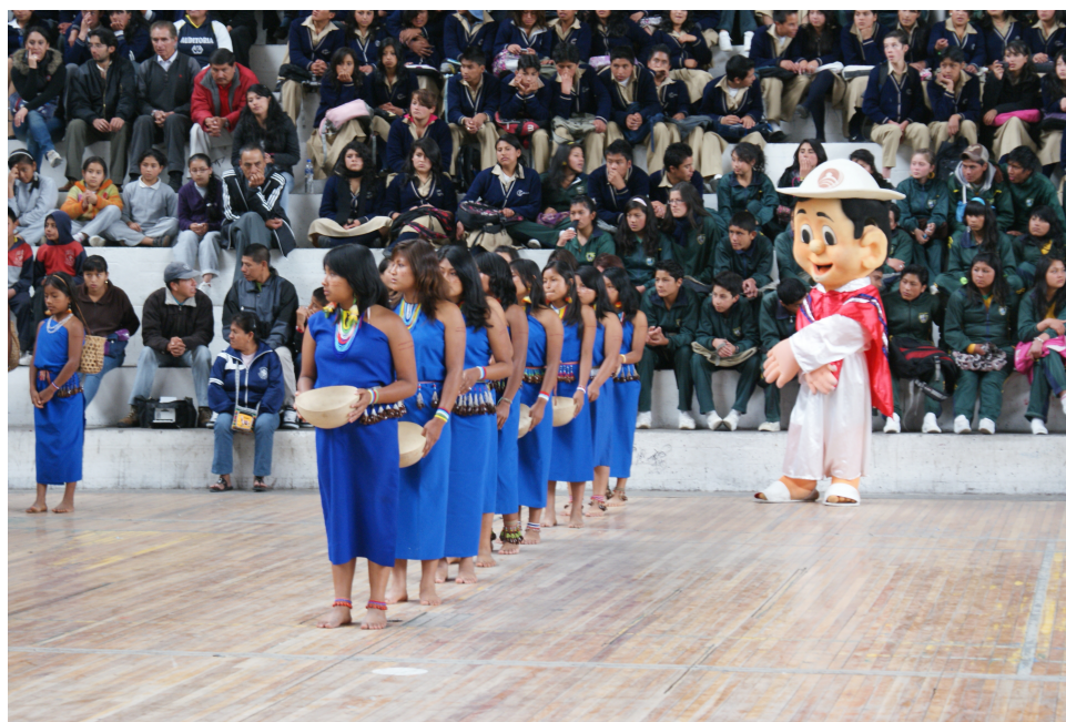
Fig. 7: Preparing to dance.

As I have noted before, I argue in this thesis that ‘indigenous’ can for the purposes of analysis be treated as an ethnic identity in its own right, at the very least vis-à-vis Ecuadorian mestizos if not on a pan Iberoamerican or even a worldwide scale. Awareness of and emphasis upon this identity among Shuar has developed gradually over the course of the last few decades. I will discuss the construction of an ‘indigenous’ identity among Shuar urban residents in Sucúa in more detail in the next chapter; here I would just like to briefly examine the way that living on the ‘ethnic boundary’ between indigenous and non-indigenous populations influences urban Shuar construction of their ethnic identity as ‘indigenous’.