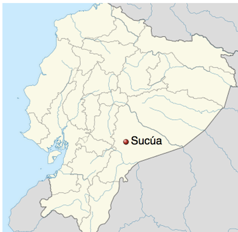
Fig. 3: Map of Ecuador showing location of Sucúa.