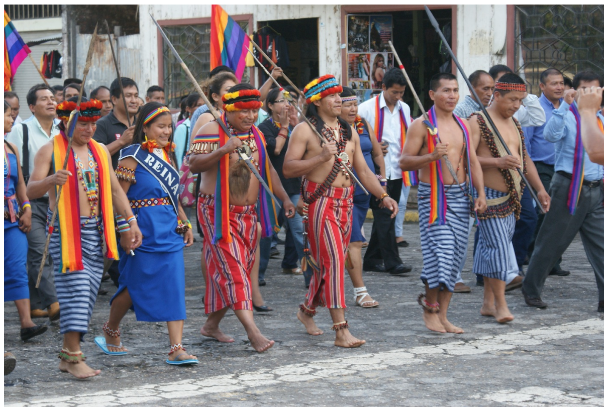
Fig. 9: Parade to open the annual FICSH General Assembly.

Indigenous identity is first and foremost a political identity. The power of these symbols of ‘Indianness’ – the feathers, body paint and Amerindian languages – lies in the fact that they afford those who wield them a kind of symbolic capital, 42 allowing them successfully to make political claims for land and other rights, including the return of several tsantsas [shrunken heads] from the National Museum of the American Indian’s (NMAI) Research Branch (formerly the Heye Foundation) in the Bronx, New York, in 1995, an act which further consolidated the symbolic capital of the Shuar Federation (see Rubenstein 2007).