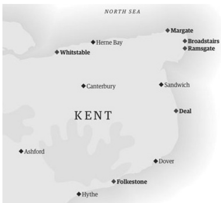
Figure 1. East Kent ( http://static.guim.co.uk/sys-images/Travel/Pix/pictures/2011/8/5/1312540551657/Kent-coast-001.jpg )

Modern Herne Bay is a coastal town situated on the north Kent coast, fronting the Thames Estuary, situated fifty five miles east of London (Charing Cross). Whitstable lies four and one half miles to the west, Margate eleven miles to the east and Canterbury seven miles to the south. 38 These distances are based on a direct linear route "as the crow flies" and in each case the mileage is by necessity increased if consideration is taken of transport routes, such as road or rail. A map is included in figure 1 to show the location of Herne Bay in the context of East Kent.