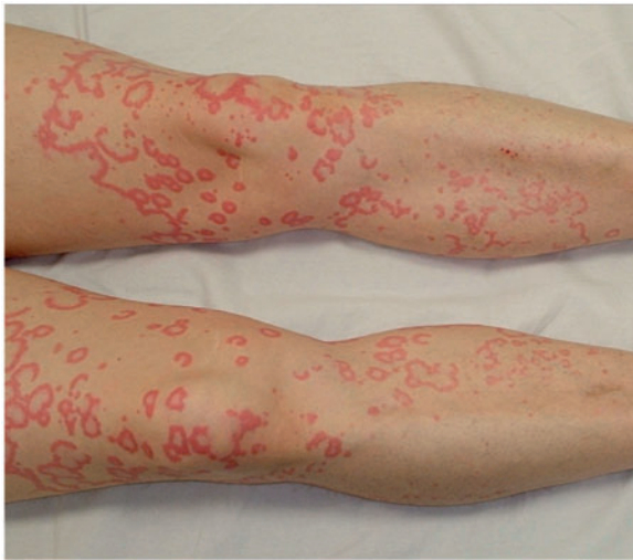
Figure 1. Photograph of rash during attacks.

with granulocyte colony-stimulating factor and broad spectrum antibiotics was unnecessary as the fever and cytopenias spontaneously resolved.