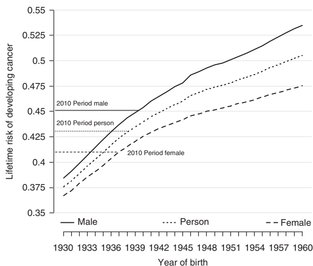
Figure 1. Estimated cohort lifetime risk for 1930–1960 year of birth with results from the period for 2010 lifetime risk by sex for UK population.