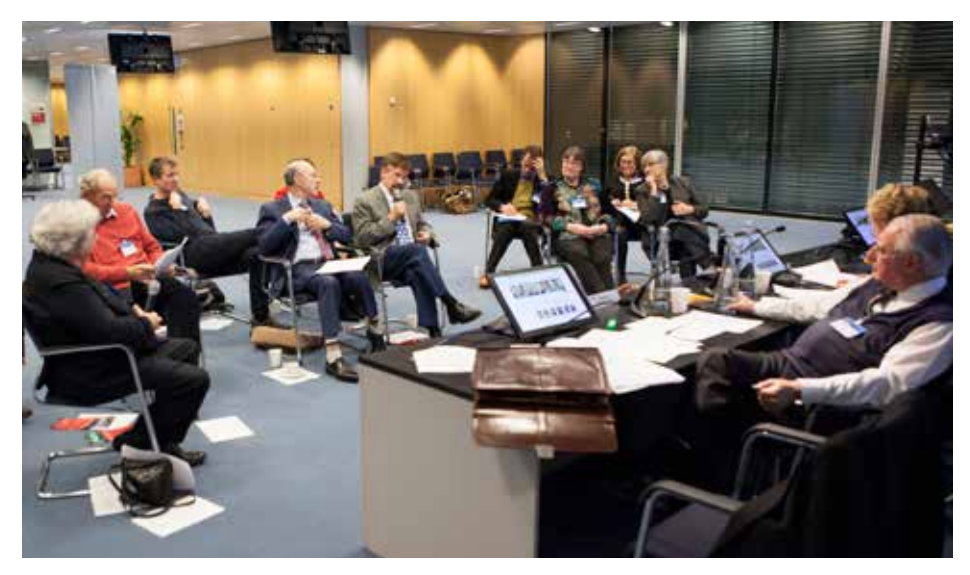
Figure 17: Participants at the Witness Seminar

your name because you'll then sow confusion among people who are already unaccepting and confused. So, even if we were to assume that your suggestion is the far better name, and Jen has contested that, you really want to be very careful about mixing people up, as can easily happen.