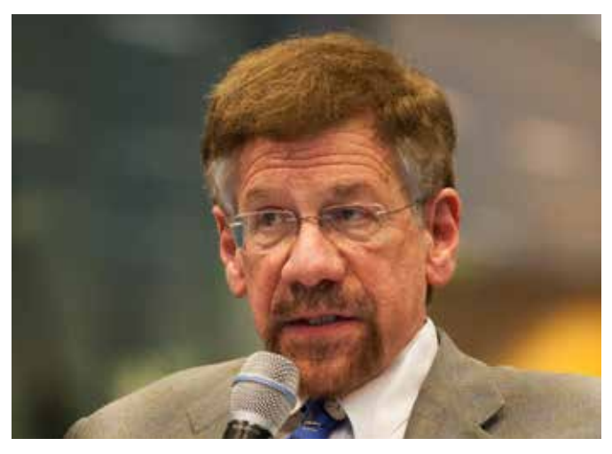
Figure 4: Professor Alfred Lewy