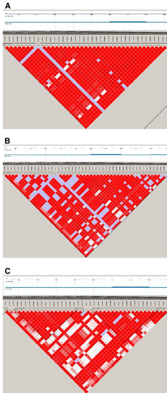
Figure 2 Linkage disequilibrium of SNPs in and around DHCR7 and NADSYN1 for A) JPT + CHB, B) CEU and C) YRI. The numbers within each square indicate the D' values. Squares are colour-coded as follows: white: D' < 1 , LOD < 2 ; blue: D' = 1 , LOD < 2 ; pink: D' < 1 , LOD \geq 2 ; and bright red: D' = 1 , LOD \geq 2 .