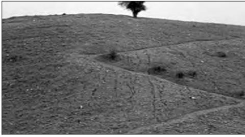
Fig. 1. Where Is the Friend's House? (Abbas Kiarostami, 1987)

the central point of engagement set up by the film: this lies in the visual and spatial organization of the narration of Ahmed's repeated journeys on foot across the open spaces that separate the two villages. Through mise en scène , mobile framing and editing, each journey is mapped in considerable detail, such that the geography becomes as important a protagonist as the boy himself. The signature shot of Where is the Friend's Home? is a strikingly composed image of a zigzag uphill path that marks the start of each of Ahmed's three journeys away from Koker (fig. 1), lending a ritual quality to this exploration of a child's geography: his leaving and rejoining of security, his incessant coming and going, his going exploring beyond a permitted, secure, spatial range. In this single, repeated, image is condensed the very psychodynamics of cultural experience as a negotiation and inhabiting of "spaces between." 21