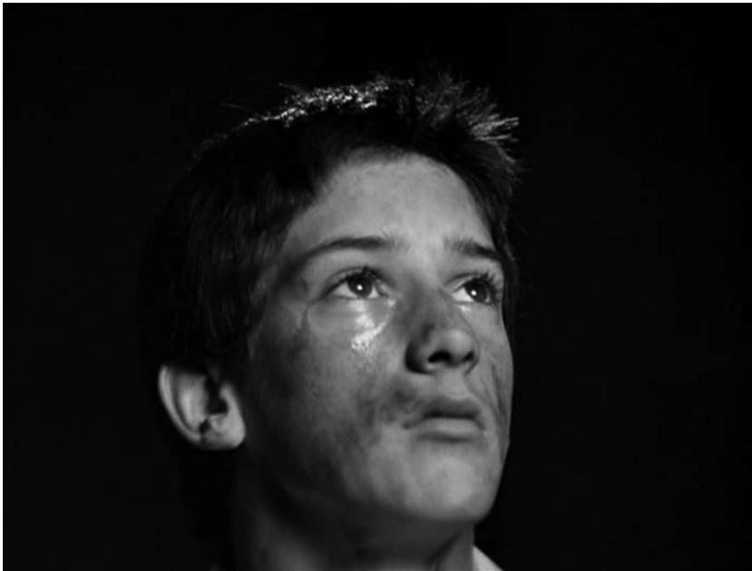
Figure 2. My Ain Folk (Bill Douglas, 1973) Copyright British Film Institute