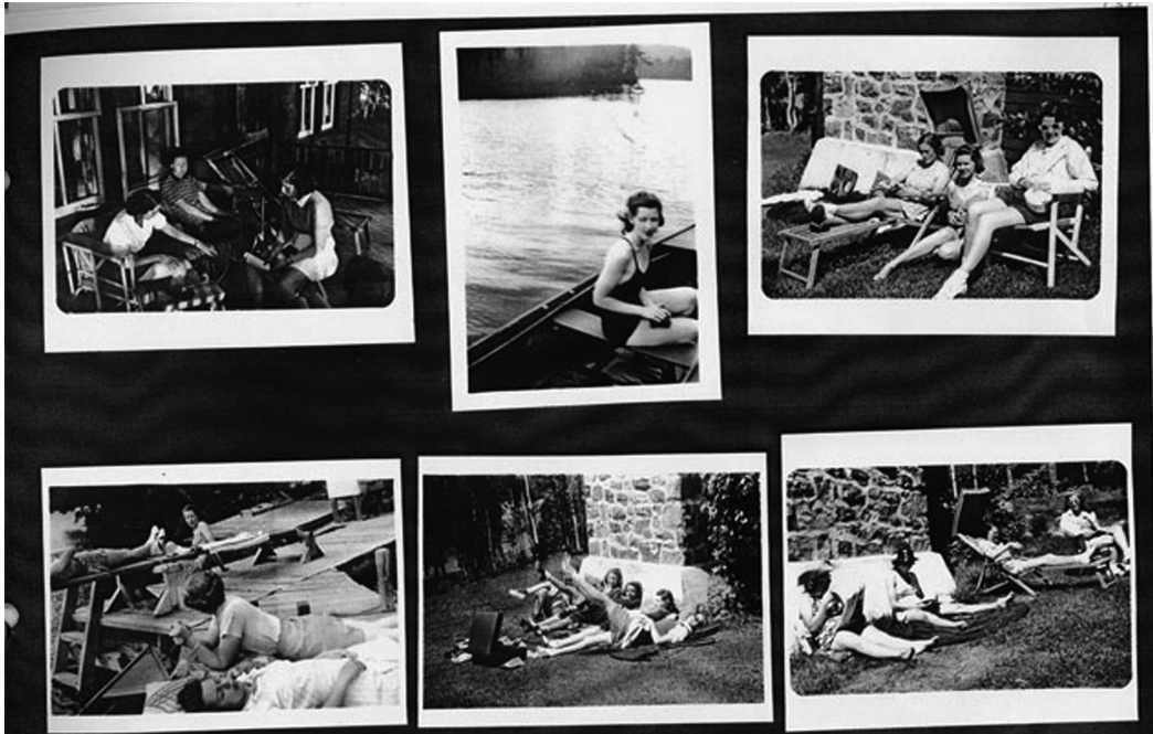
Figure 5. Family album detail, McCord Museum, Montreal