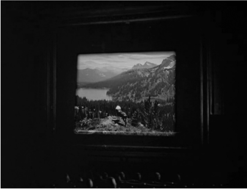
Figure 1. My Ain Folk (Bill Douglas, 1973)