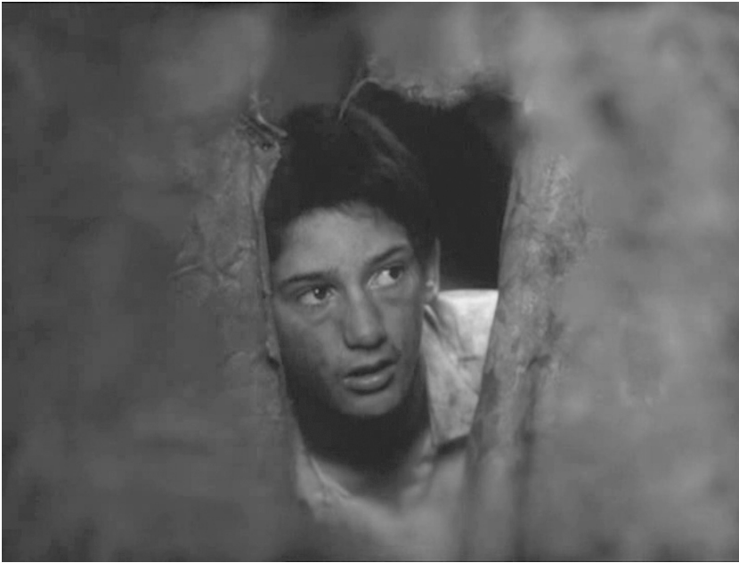
Figure 3. My Ain Folk (Bill Douglas, 1973)

impossible, to maintain through filmic means (see, for example Metz, 1982). As a consequence of this, as Elizabeth Bruss points out, the ‘I’ of literary autobiography does not translate to cinema: