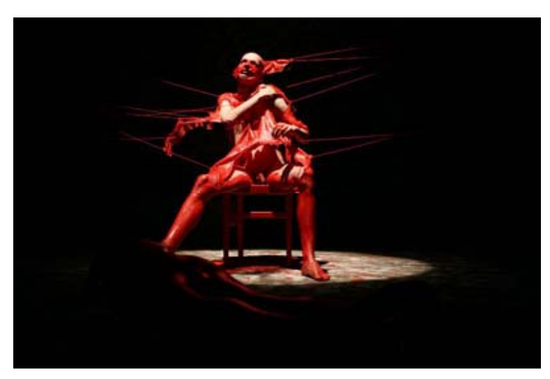
Fig. 4: Suka Off, Untitled (2009), Visions of Excess, SPILL Festival, London, 2009.