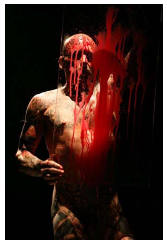
Fig. 6: Ron Athey, Ecstatic (2009), Visions of Excess, SPILL Festival, London, 2009.