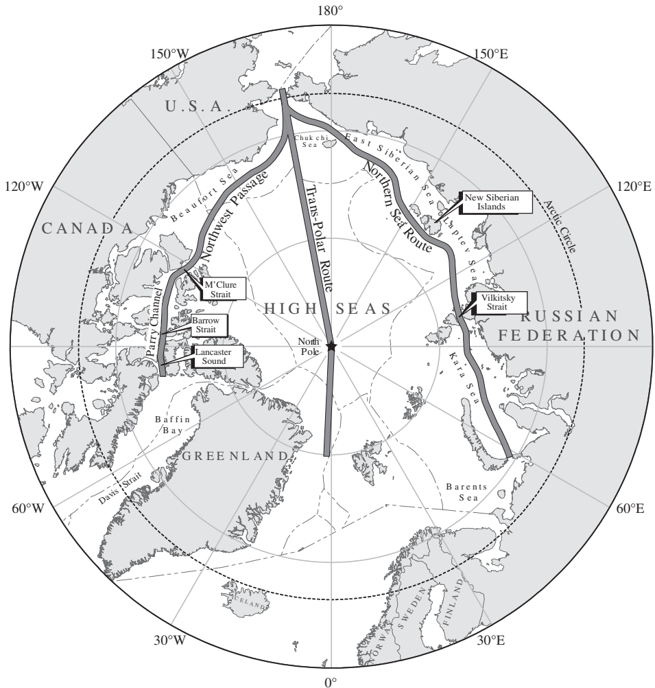
Figure 1. The NSR, The NEP, and Trans-Polar Route (adapted from Stephenson et al. 2013b).

Current, flowing toward the Northeast Atlantic (Rasmussen and Turner 2003, p. 68). A third option, the Transpolar Route traversing the North Pole, encounters thick and persistent ice. Even aggressive climate model scenarios project extensive sea ice in winter in the central Arctic for decades to come (Østrem et al. 2013).