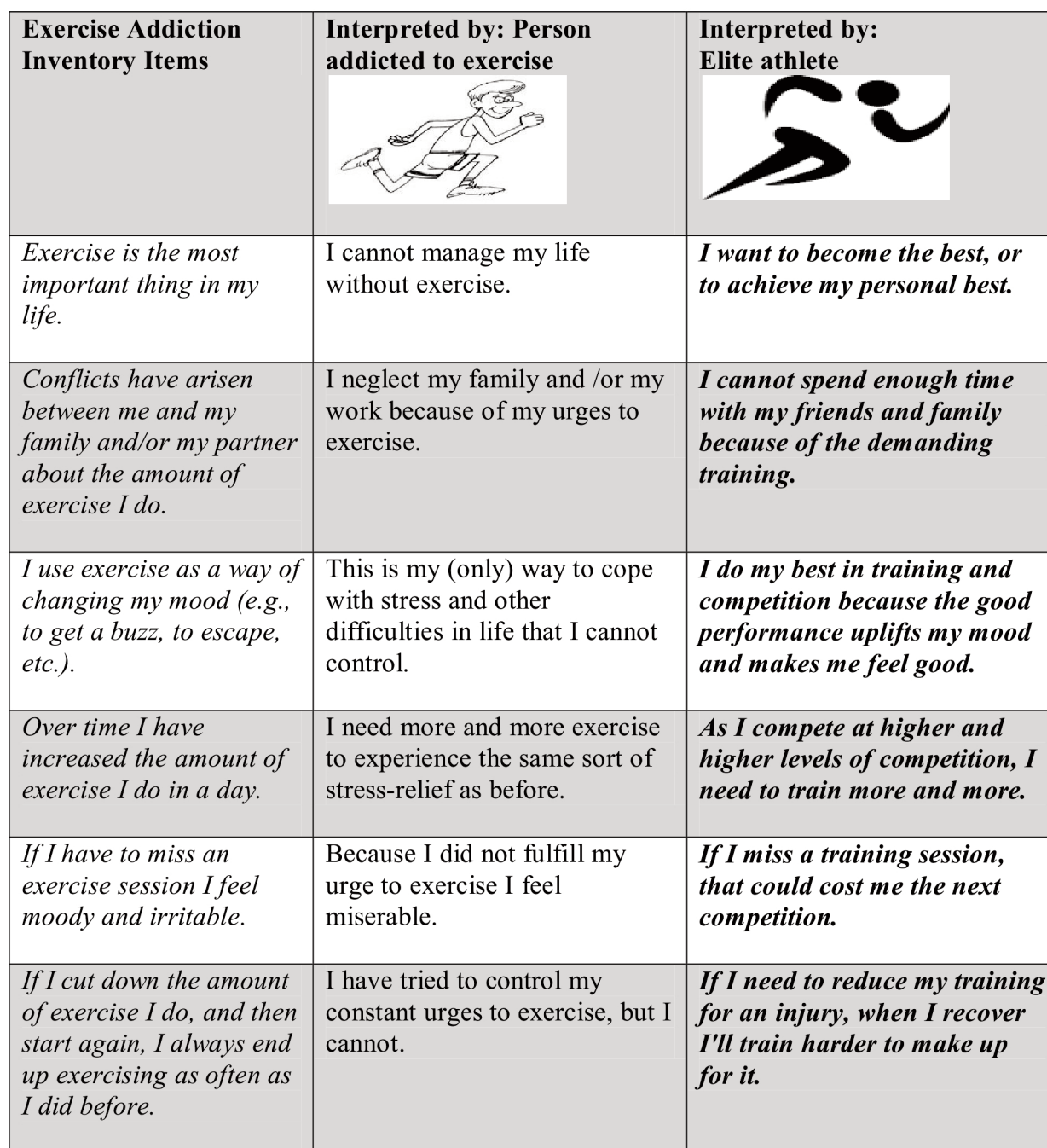
Figure 2. Illustration of the possible different interpretations of the statements on the EAI by maladaptive exercisers and elite athletes. Note: The key point of Figure 2 is to illustrate that different interpretations may yield equally high scores leading to erroneous conclusions.

may cost them participation at an upcoming competition. Further possible differences in interpretation of instrument items are illustrated in Figure 2.