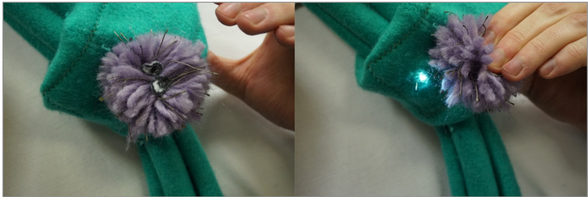
Figure 3: Scarf with a gestural interface to activate the circuit.

prototyping methods demonstrated by facilitators. The scarf included pressure sensors to create a 'smart scarf' with an anthropomorphic pom-pom attachment to express mood (according to the participant's specification). Via a snap-fastener, this could be attached to the garment and compressed to express happiness or feelings of contentment.