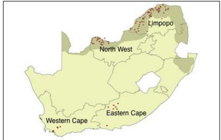
Figure 1: Livestock Guarding Dog placements (indicated by red dots) in South Africa (map courtesy of Cheetah Outreach).

Dogs comprised of 78 males, 49 females, and 12 dogs for which sex data could not be obtained as the farmers had only provided dog names, which could be sexually ambiguous. All dogs were sterilized at seven months of age. This was done by a qualified veterinarian on the