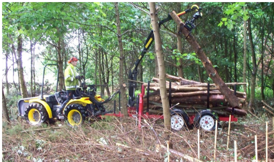
Dave Atkinson (Forestry lecturer) uses small forwarder to extract felled timber in June 2008. Staked quadrats and brush can be seen in the foreground. Brush was left to decompose on site.