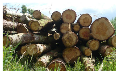
Stack of fuelwood from thinning