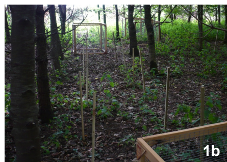
North Thurlbar post-thinning, July 2008: paired plots above power line, 1a and 1b on schematic plan. 1a - thinned plot and 1b - control plot.