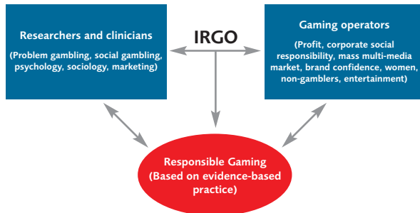
Figure 2: Emerging dissemination relationship between academic researchers/clinicians and the gaming industry via IRGO

As academic researchers we know that there is a lot of research information out there in a wide variety of outlets (e.g. psychology journals, sociology journals, criminology journals, social policy journals, economics journals, and journals specialising in gaming, gambling, addiction and