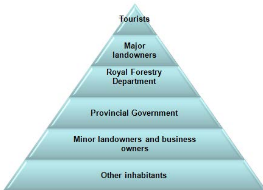
Model 1: Illustration of the structure of influence in Phi Phi’s development (author’s own from data)

would be most apt for the situation on Phi Phi, that, ‘reconstruction processes are not newly constructed in the light of the disaster but are the result of existing power struggles and structures’. Scheyvens (2002) added strength to this argument, highlighting due to the complex interplay of class, values and power that exists at a destination level, it ultimately may result in a lack of equitable participation and consultation in planning for tourism. This would certainly appear to be the case on Phi Phi, whereby, on account of economic power and landownership, the key players in shaping the future of Phi Phi’s development are the landowners. The ladder of influence that exists on Phi Phi is illustrated below. It can be seen that the desires being realised in the island’s development are those of the groups towards the apex of the pyramid.