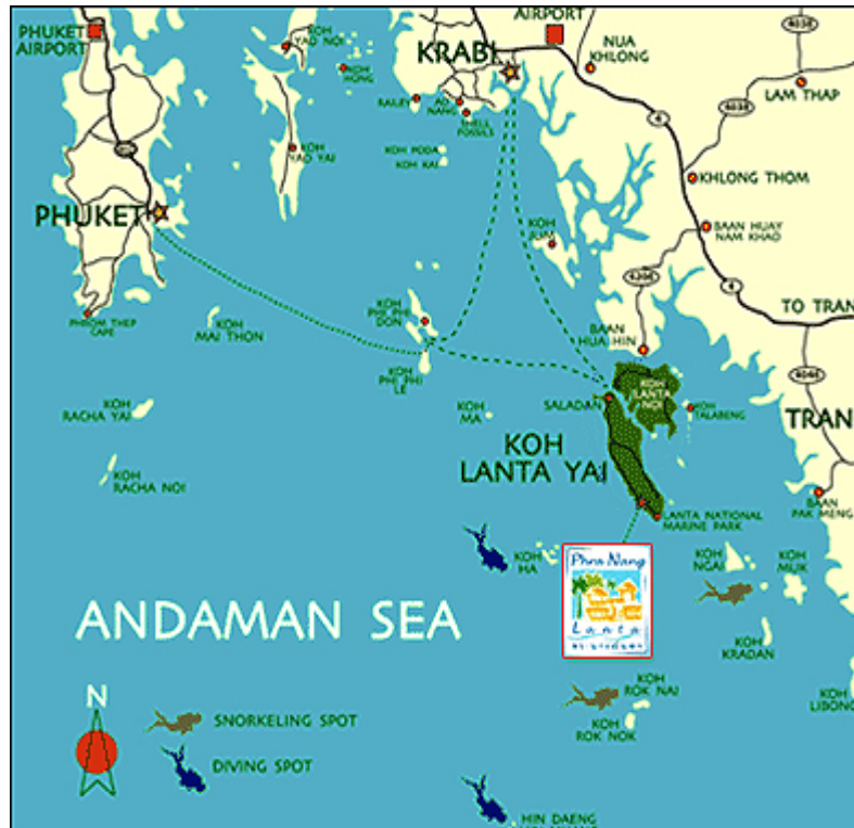
Figure 1: Map to illustrate the location of the Phi Phi islands within the Krabi Province