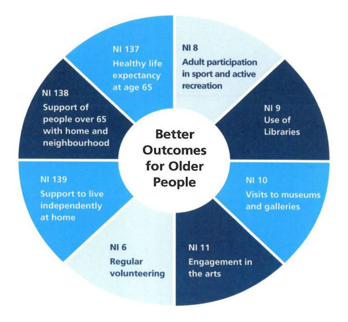
Figure 2 Culture and Sport and Adult Care contributing to each others improvement

In theoretical terms the potential for sport and physical activity to contribute to health and wellbeing, and to various other objectives in the Community Strategies, Local Area Agreements and local service delivery plans initiated by the previous government was significant and wide ranging. As well as contributing directly to Sport, Leisure and Cultural Service objectives and targets, the potential range and scale of the contribution that both sport and physical activity could make is indicated by their inclusion in all four blocks or themes of the various generations of the LAAs. An example of their interdependence and potential contribution to other agendas , in this case the Adult Social Care agenda, is shown in Figure 2 taken from an IDeA report (IDeA 2010).