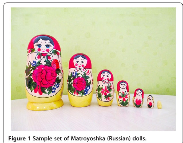
Figure 1 Sample set of Matryoshka (Russian) dolls.

Having been seated, it was explained to each child that in this task they were going to be asked to look carefully at the dolls and then choose (one at a time) 3 dolls to represent someone they liked (positive charge), someone they did not like (negative charge) and someone that was just a person, that they neither liked nor disliked (neutral charge). The dolls were then placed one at a time in height order (height order direction randomised for each child) in front of them, along the back edge of a sheet of A3 paper. Next the children were told that each time they chose a doll, they should place it on the piece