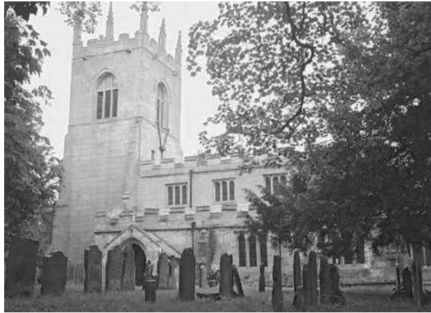
3. Church of St. Mary Magdalen (15th cent.), Walkeringham, Notts.