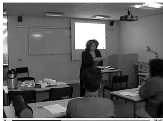
Fig 2 – Camera 2 records a wide angle.