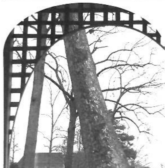
the gazebo/spring of Boiling Springs, NC, located on the Gardner-Webb University campus