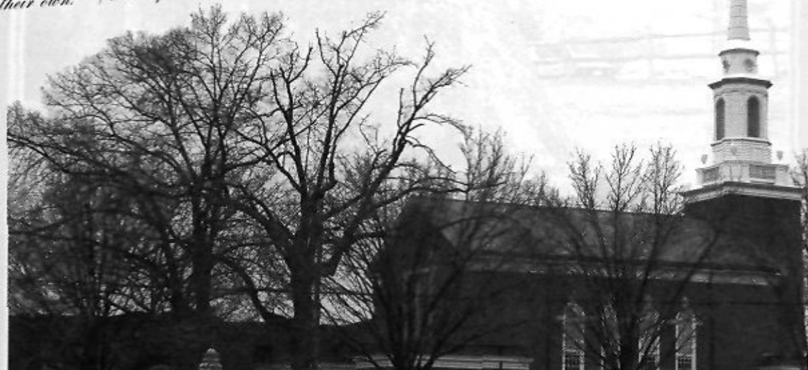
John R. Daver, Jr. Memorial Chapel on the campus of Gardner-Webb University in Boiling Springs, NC