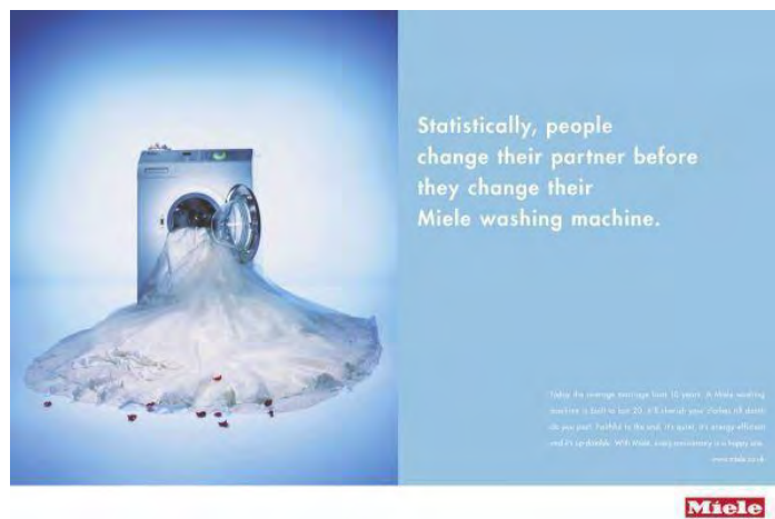
Figure 2. Miele print ad (released March 2003)