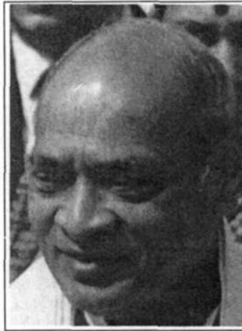
P.V. Narasimha Rao, the Indian Prime Minister

Leaders of the Indian freedom struggle, such as Mahatma Gandhi, had never envisaged a Hindu India, but rather a secular state in which people of all religions would live in harmony. The constitution of India reflects their ideals. However, Hindu chauvinists and fundamentalists have often misunderstood or misconstrued their good intentions. Mahatma Gandhi was himself killed by a Hindu fanatic. In