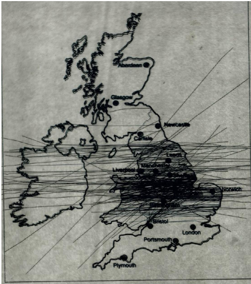
Figure 4: Where is the North/South divide?

The lines on Figure 4 range from just below Glasgow to just above London. The darkest area, where most lines were drawn, is found in the area in which the East Midlands is located. Most of the students drew a single line on this map (only 1% left the map blank, showing that most students believed there is a North/South divide in the UK). 5% drew two lines to indicate that they felt there should be a Midlands area in between the North and the South (and often wrote a note next to the map that they felt that it was not a case of North vs. South, but that a separate Midlands area existed). Interestingly, 12 out of total 19 participants who drew this tri-partite division were from Derbyshire schools and this can be compared to these students claiming a Midlander identity in the following task.