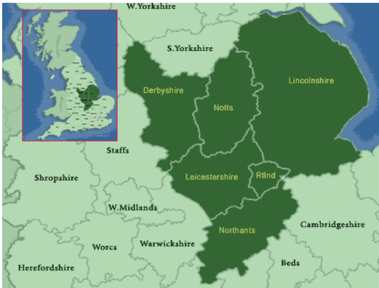
Figure 2: The East Midlands (map from www.picturesofengland.com )