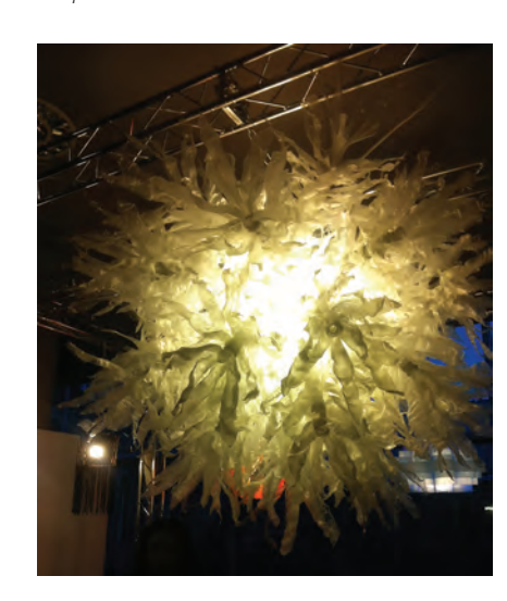
Figure 4: Sarah Turner (2014), Nova exhibited in Magic Light Nottingham 2014. © Sarah Turner.