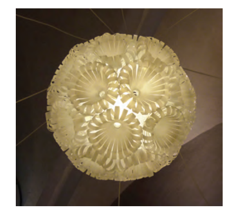
Figure 2: Sarah Turner (2008), Cola 30 Lampshade awarded 2nd place in the Keeseh International Design Competition. © Sarah Turner.