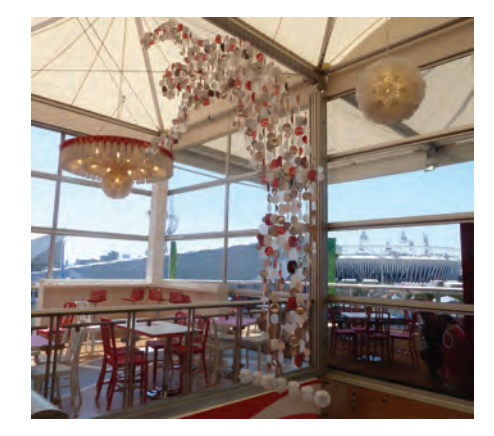
Figure 1: Sarah Turner (2012), Coca Cola 9-metre sculpture of a diving man for the London 2012 Olympics. © Sarah Turner.