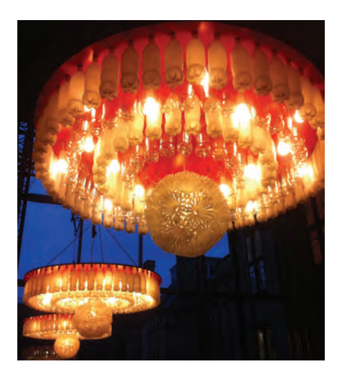
Figure 3: Sarah Turner (2012), Coca-Cola London 2012 Olympics Chandeliers. © Sarah Turner.