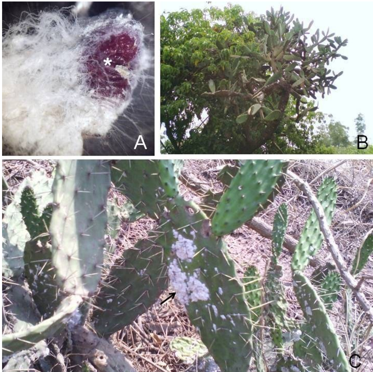
Figure 1. Dactylopius confusus on Opuntia tomentosa . A) Adult female of D. confusus (asterisk) covered with white cottony wax. B) Specimen of O. tomentosa . C) Cladodes of O. tomentosa infested with colonies of D. confusus (arrow).

A second population of the genus Dactylopius was collected in October 2019 from infested cladodes of wild Opuntia ficus-indica (L.) Mill. (Cactaceae) in Tenencia Morelos, Morelia, Michoacan, Mexico, coordinates: 19°39'063"N, 101°13'52.3"W, and 1950 m. Specimens were collected in 100% ethanol and some were slide-mounted and deposited in the CIIDIR-IPN, Unidad Michoacan, Mexico, and in the insect collection of LSU, USA. DNA of female specimens of this population was extracted using a commercial kit (E.Z.N.A. 2019). PCR was run with the following primers: For 18S rDNA, "2880" (F), 5'-CTGGTTGATCCTGCCAGTAG-3' (Tautz et al. 1988), "B-"(R), 5'-CCGCGGCTGCTGGCACCAG-3' (Von Dohlen and Moran 1995); for 28S rDNA, "s3660" (F), 5'-GAGAGTTMAASAGTACGTGAAAC-3' (Sethusa et al. 2014), "28b" (R), 5'-TCGGAAGGAACCAGCTACTA-3' (Sethusa et al. 2014). Conditions for PCR were as follows: Step 1: 1 min at 94°C, step 2: 40 s at 94°C, step 3: 2 min at 53°C, step 4: 1 min at 68°C.