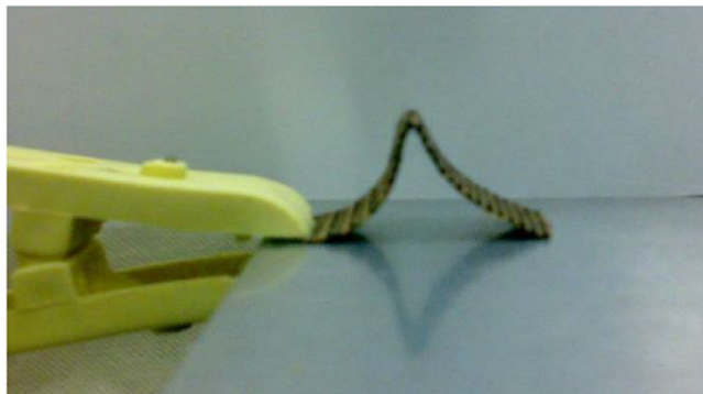
FIGURE 2 Measurement of crease angle on fabric strips