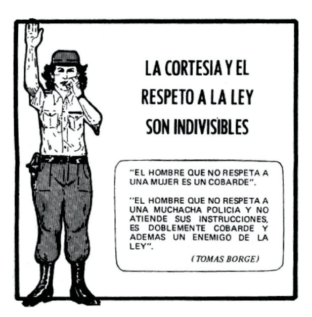
Figure 1.1. 'Courtesy and respect for the law are inseparable'. 'A man who does not respect a woman is a coward. A man who does not respect a young female police officer (una muchacha policía) and does not follow her instructions is twice as cowardly and also an enemy of the law.' (Tomás Borge) (Image: Barricada, 14 Sept. 1980)

and alcoholism as social ills and provided many former prostitutes with new training and employment opportunities.<sup>35</sup>