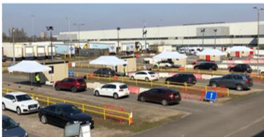
New test centre in Nottingham live