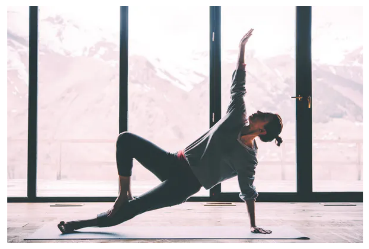
Compelling photos like this may be used to document a wellness journey.

There is no commitment to independent testing procedures and results by objective, scientific methods. Rather, online metrics (such as followers, likes and shares) validate their status. Lifestyle gurus connect and inspire their followers through disclosing their struggles and vulnerability. Each life crisis, confession and revelation shared online results in more likes and followers.