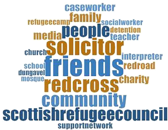
FIGURE 2 Information sources [Color figure can be viewed at wileyonlinelibrary.com ]

Figure 2 shows the frequency distribution of sources of information in our study population, based on the number of times each source was used to fill information gaps during integration. Information gaps were more commonly filled through friends, solicitors, Scottish Refugee Council, community centers, the Red Cross, and family members. The data show that refugees received different information from specific people and places at various points on the integration journey, highlighting the importance of the frequency of sources to meet information needs. For instance, an asylum seeker who arrived via the road route acquired certain information while at the refugee camp, then, when granted refugee status bridged the information gap through, for example, caseworkers and the Scottish Refugee Council. On the other hand, if their asylum application was not granted, the refused asylum seeker's journey would include a detention center (Oduntan & Ruthven, 2017). The ability of refugees to meet information needs at detention centers turns the center into an information source for refugee integration. In the following sections, we present information sources and uses and explain the operation of these sources on the matrix journey. Quotes spoken directly by participants are presented to illustrate themes.