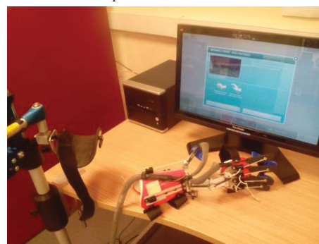
Figure 1 The SCRIPT system. Videos demonstrating the system can be found on the Youtube channel

Our approach for developing such component was that of defining a gesture recognition system which enabled subjects to control the games by moving their arm, wrist and fingers. This modular approach makes such interaction potentially expandable to other games and allows a more comprehensive training. Design and development was evaluated using formative assessment of the work with a triad of patients, their family members and their health care professionals. The system had then undergone summative evaluation with 20 patients. In this paper, we investigate how subjects focused on arm, wrist or hand training, based on their level of impairment.