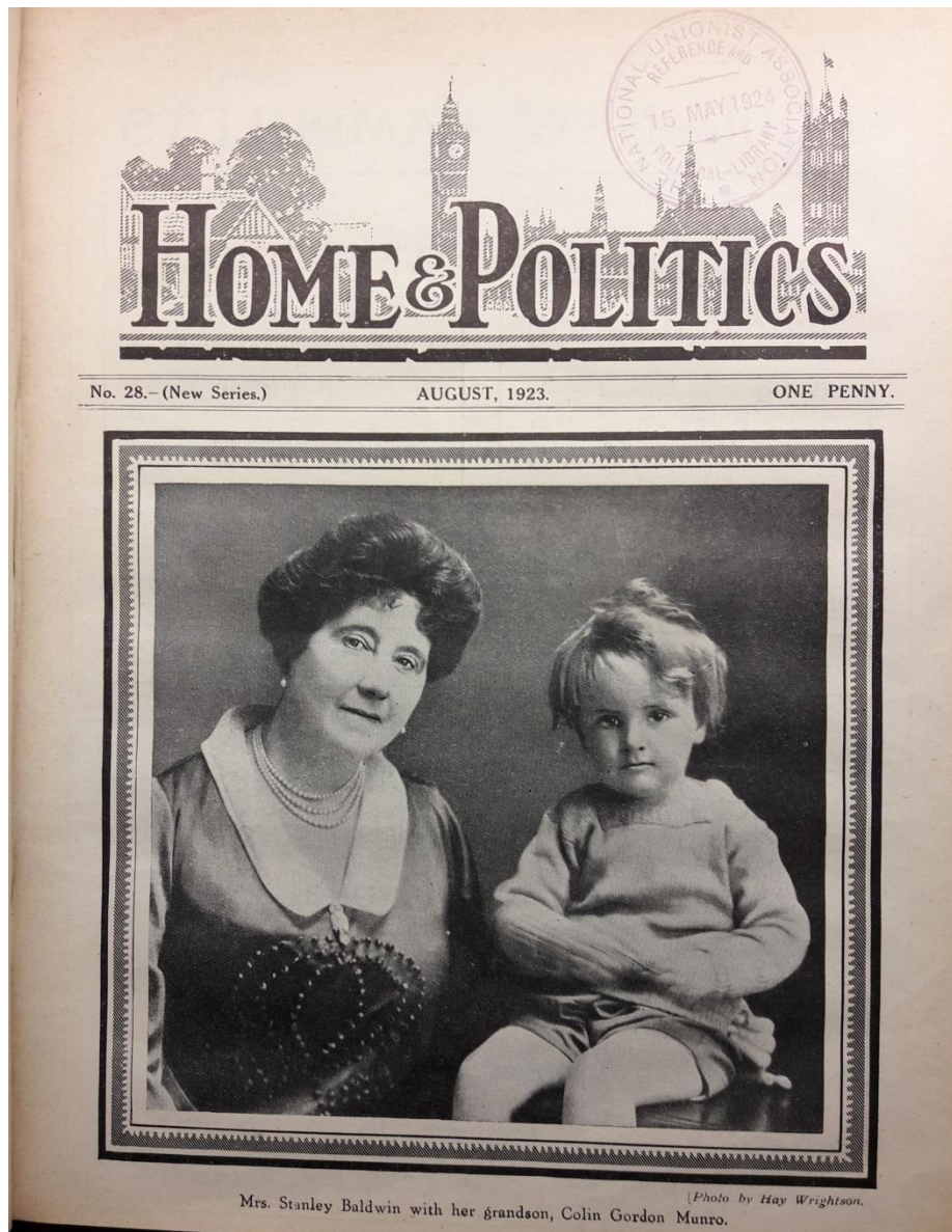
Figure 3. Front cover of Home and Politics , no. 28, August 1923