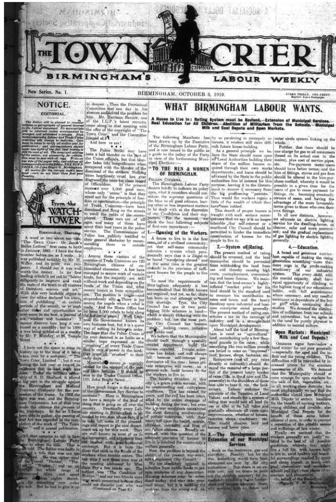
Figure 1. The Town Crier , new series, no. 1, 3 October 1919

Chamberlain was also determined to avoid accusations of left-wing extremism, criticising striking railway workers at a mass meeting at Smithfield market for their hostility towards representatives of the Birmingham Mail and Birmingham Post as a result of their newspapers having printed anti-strike cartoons. Chamberlain also praised the Birmingham Gazette's 'sympathetic' reporting of the strike, even though he admitted 'I loathe the politics of the Gazette .' 35 The paper also wittily debunked one of the more extreme right-wing attacks on Labour, as it bemoaned the financial pressures on the party, 'Bolshie gold not having come to hand.' 36 Although the influence of the Town Crier is impossible to determine, there was a significant increase in the Labour vote in November 1919 and the party won twelve of the twenty municipal seats contested in Birmingham (as well as a third