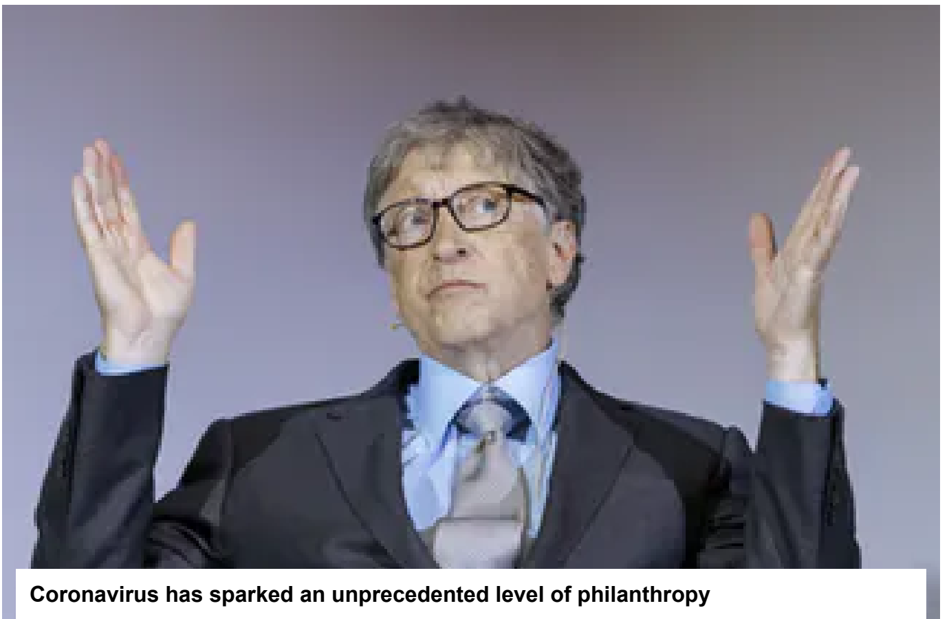
Coronavirus has sparked an unprecedented level of philanthropy