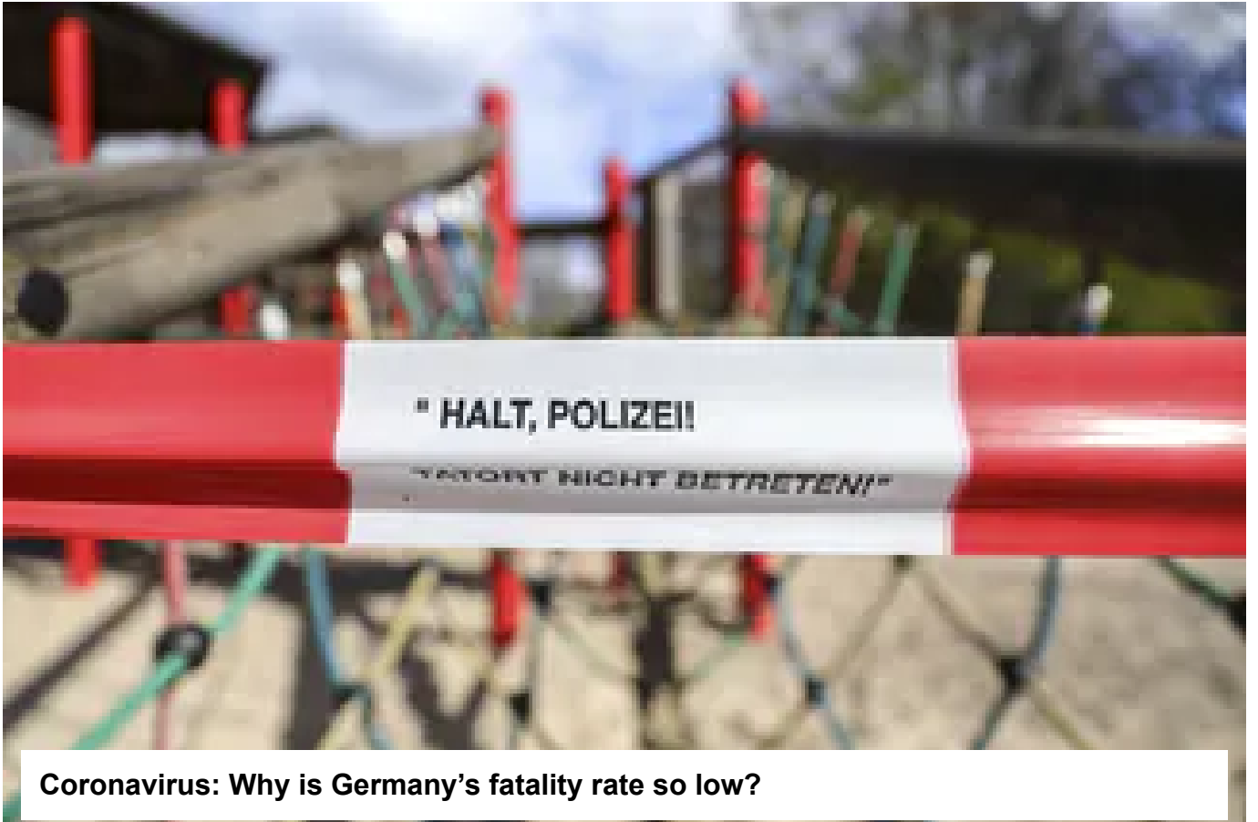
Coronavirus: Why is Germany's fatality rate so low?