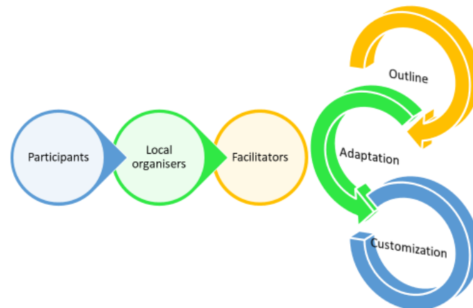
Figure 3 Workshop adaptation and customization

to a total of around 1,200 (January 2020). The Inventory of ICT tools and open educational resources ( https://www.ecml.at/ECML-Programme/Programme2012-2015/ICT-REVandmoreDOTS/ICT/tabid/1906/language/en-GB/Default.aspx ) was accessed over 150,000 times between beginning of January 2019 and beginning of February 2020, showing language educators' continuing demand for assistance with technology integration in language teaching. Ongoing research with workshop participants has deepened the understanding of teachers' needs and their self-evaluation of ICT skills and added a series of vignettes describing typical attitudes of language teachers towards ICT use (Stickler & Emke, 2015).