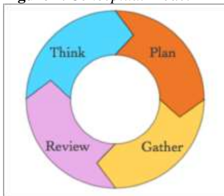
Figure 2. Conceptual Model - AAA Cycle

The AAA cycle links into the Digital Forensic process model (Figure 1) by aiding the identification, preservation and recovery of potential evidence.