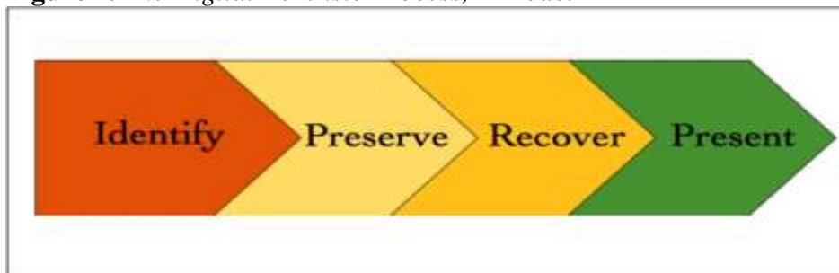
Figure 1. The Digital Forensic Process, A Model

A visual encapsulation of this process is given in Figure 1, below.