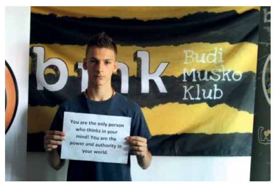
Be a Man Club, by the Young Men's Initiative.