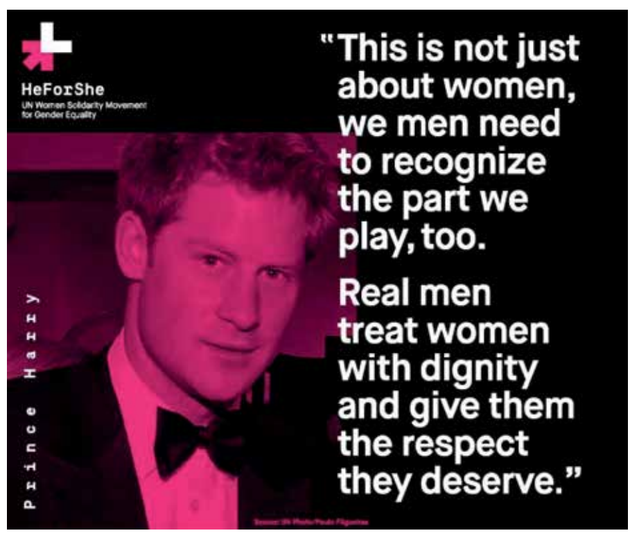
HeForShe social media ad campaign.

The various strains of "engagement work" endeavour to express the goals of gender equality in a way that resonates with men's own experiences, to promote alternative role models or attitudes, and to try to market gender equality as something that benefits men. It is helpful to distinguish what this paper deems "engagement work", which are clusters of programme-led efforts to change the attitudes of men who are not already engaged in feminist politics, from the long and complicated history of men's collective action within the feminist paradigm. Each of these strains has historical roots within the attempts by groups of men