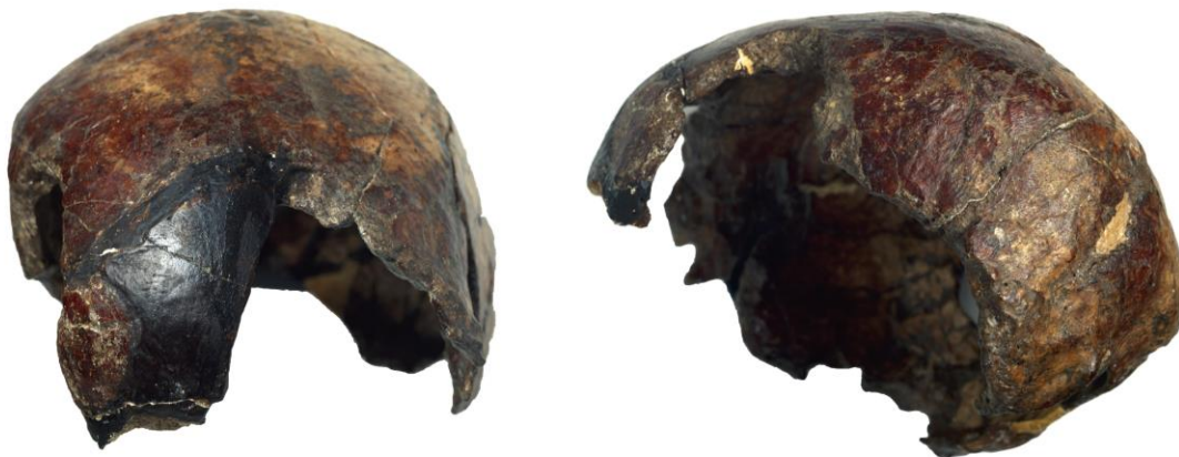
Figure 2: Skhul 9 cranium (early H. sapiens from Israel). Front (left) and left (right) views.

In the first description of the Mount Carmel material, McCown and Keith recognised that Skhul had more H. sapiens affinities than Tabun. A possible ancestor-descendant relationship was originally hypothesised between the two, which were thought to form a single evolving population that they named ' Palaeoanthropus palestinensis ', showing features intermediate between Neanderthals and H. sapiens (McCown, 1933; Schwartz & Tattersall, 2002b). Skhul was at one stage believed to be only around 40 ka based on fauna and lithic similarities to Tabun (Wood, 2011). However, the Skhul material (Skhul 2, 5 and 9) is now dated to between 130 and 100 ka using ESR, U series, and thermoluminescence analyses (Grün et al. , 2005). It has even been argued that Skhul 9 may be older than the other two fossils, as suggested by its morphology and lower stratigraphic position (Grün et al. , 2005; Stringer, 1996). The new dating required a rethink in terms of Skhul's phylogenetic position, showing Neanderthals were chronologically later than some H. sapiens in the Levant, providing indirect support for a recent African origin for H. sapiens , rather than the regional evolution of H. sapiens from 'archaic' Homo including Neanderthals (Stringer & Buck, 2014).