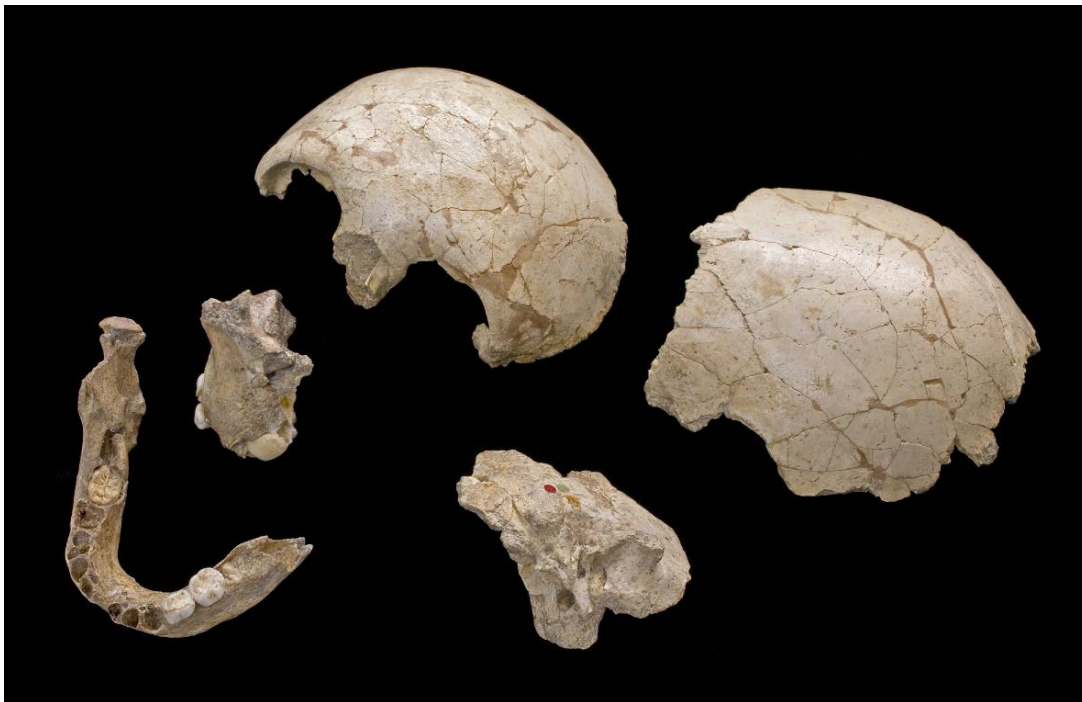
Figure 3: The Devil's Tower (Gibraltar 2) Neanderthal child.

The remains were generally thought to be of a child of approximately five years old, but this conclusion was challenged in 1982 by Tillier, who suggested that the bones might represent two children, one aged about three years (the temporal bone) and the other about five (the rest of the bones) (Tillier, 1982). Using the then novel technique of counting perikymata on an incisor, it was possible to counter this suggestion by inferring that the Devil's Tower child was about four years old at death, and by comparing perikymata of children with known ages at death and their temporal bone morphology it was confirmed that the Devil's Tower remains belonged to a single individual (Dean et al. , 1986; Stringer et al. , 1990). A CT data-based virtual reconstruction of the cranium subsequently enabled mirroring of unilaterally missing elements and allowed the estimation of the soft tissue parameters, which supported this conclusion (Ponce de Leon & Zollikofer, 2000). There has been much debate over Neanderthal life history and the ontogeny of characteristic craniofacial traits; the accurate dental aging of the Devil's Tower child means that it is important in this discussion (Ponce de Leon & Zollikofer, 2001; Smith et al. , 2012).