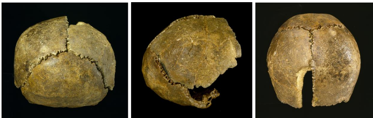
Figure 5: Swanscombe 1 early H. neanderthalensis partial calvaria. From left to right: back, right and top views.