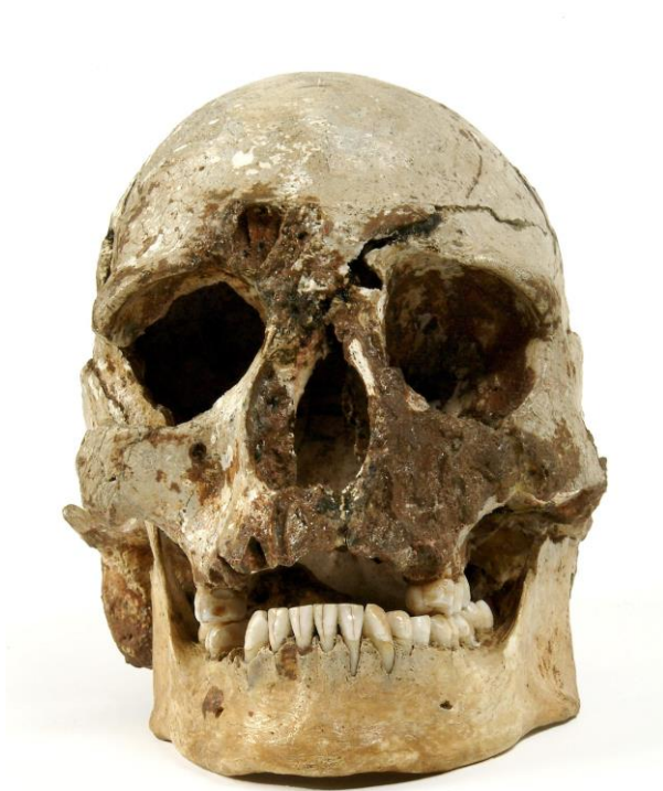
Figure 4: Gough's Cave 1 skull (Mesolithic H. sapiens ).

The GC1 skeleton, dated to 9230-8930 BP radiocarbon years (Stringer, 2000), is still the most complete ancient human skeleton from Britain. The cranium (Figure 5) is fairly complete, but has fragments of the basicranium, right cranial and orbital wall, left frontal/parietal, and left parietal/temporal missing (Humphrey & Stringer, 2002). The muscle attachments on the cranium are robust and the individual is thought to be male, yet other facial features such as the supraorbital region are comparatively gracile (Humphrey & Stringer, 2002), as is the postcranial skeleton. There is a lesion on the right supraorbital margin, which suggests a nonspecific infection resulting in osteomyelitis (Humphrey & Stringer, 2002). Six maxillary molars are present and these are worn, but the other maxillary dentition is missing; the mandible preserves all the teeth except the right premolars (Humphrey & Stringer, 2002). The GC1 skeleton also preserves a mandible, vertebrae, sacrum, ribs, clavicles, humeri, radii, ulnae, metacarpals, phalanges, femora, tibia, a talus, and a calcaneus all in a variable state of preservation (Oakley et al. , 1971; Churchill, 2001a; Trinkaus, 2001; Churchill & Holliday, 2002; Trinkaus, 2003).