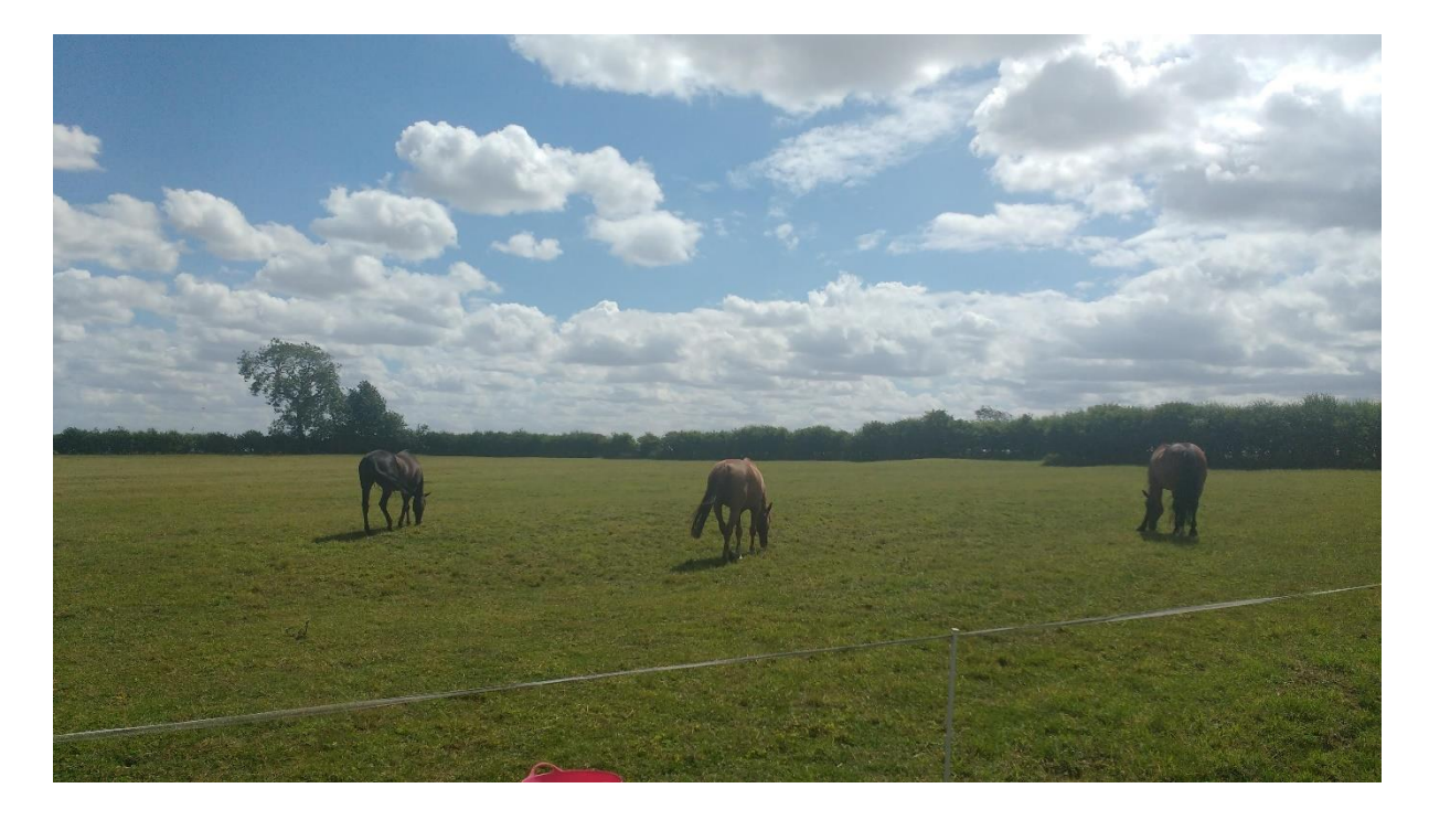
Figure 2: Horses grazing in the field

Later, we are out on our first trek of the holiday, taking in the stunning scenery of rolling hills, moors and grassland. The horses are confident and relaxed, in this unknown but still familiar environment. Charlie has a spring in his step as he walks along, and as we turn onto a stretch of grassland he effortlessly picks up a powerful but steady canter, covering the ground in unison with the others. We follow the track, winding our way under branches and jumping the odd little bush or ditch, and come to an easy stop at the end of the field. For hours we explore the countryside, passing through picturesque villages, lush grassland valleys, hills and forests. We cross streams with no hesitation from the horses, who confidently step into the water with only a slight glance, and stride out positively, shifting between paces almost without being asked, tuned into our commands, each other and their surroundings.