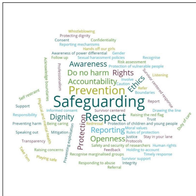
Figure 1 The ARISE collaboratively developed ‘word cloud’ to explore understandings and definitions of safeguarding.

identification and other risks, (2) safeguarding legislation and service provision and (3) developing an Action Plan. See table 2 for a summary of core risks and mitigation strategies identified across the consortium.