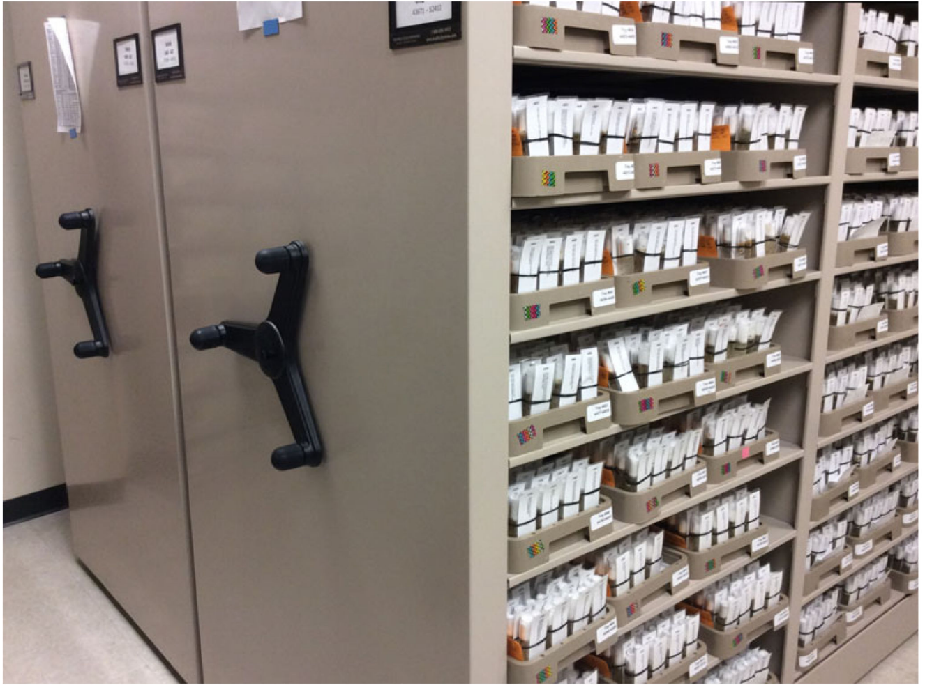
Figure 2. The main storage room for the BDSC Drosophila collection, with moveable library shelving. One collections manager remarked that some of the stock keepers chose to make their stocks look 'more distinctive' by decorating their trays with coloured labels and tape.